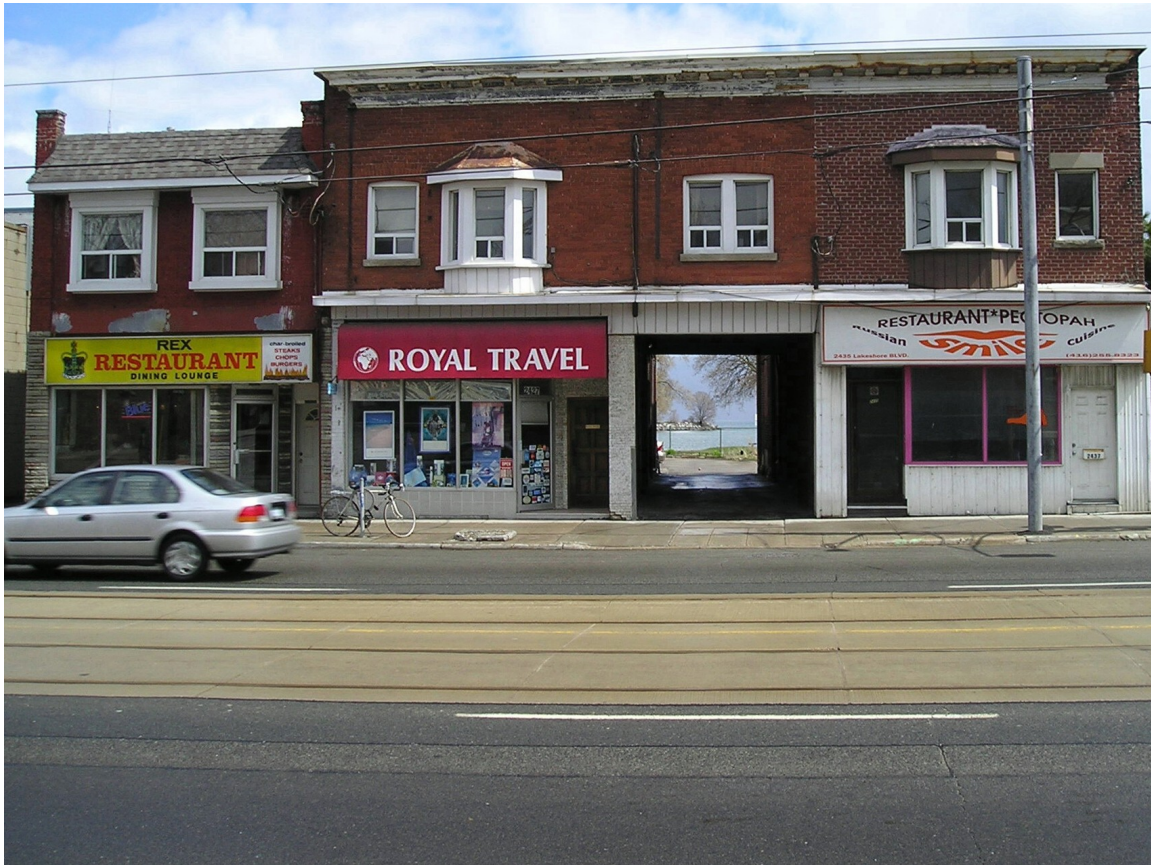
2423 to 2437 Lake Shore Blvd W – Front Elevation