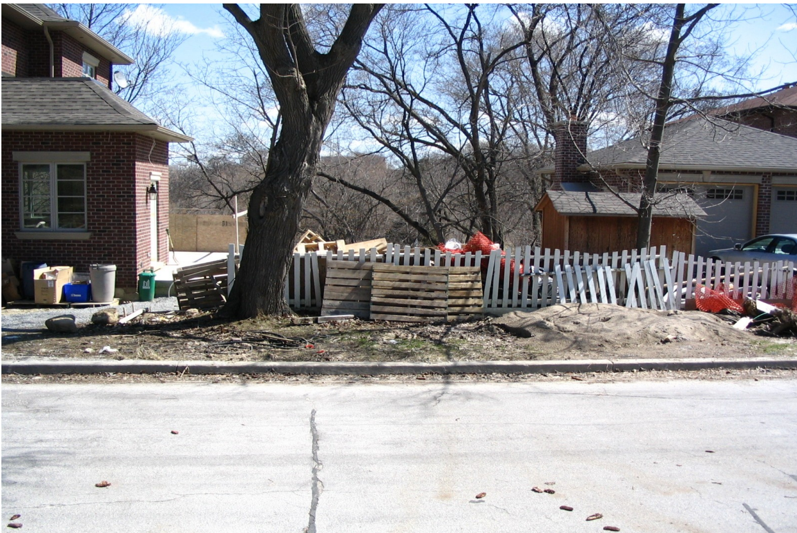
Photo # 2 – Showing the Location of the Proposed Flankage Yard Fencing