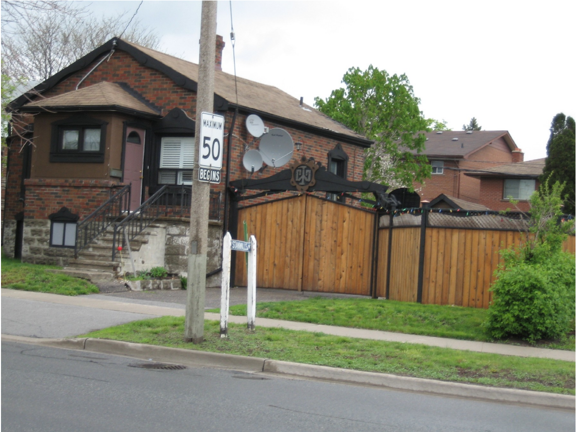
Attachment 3: Photograph of the front of the property and the gate