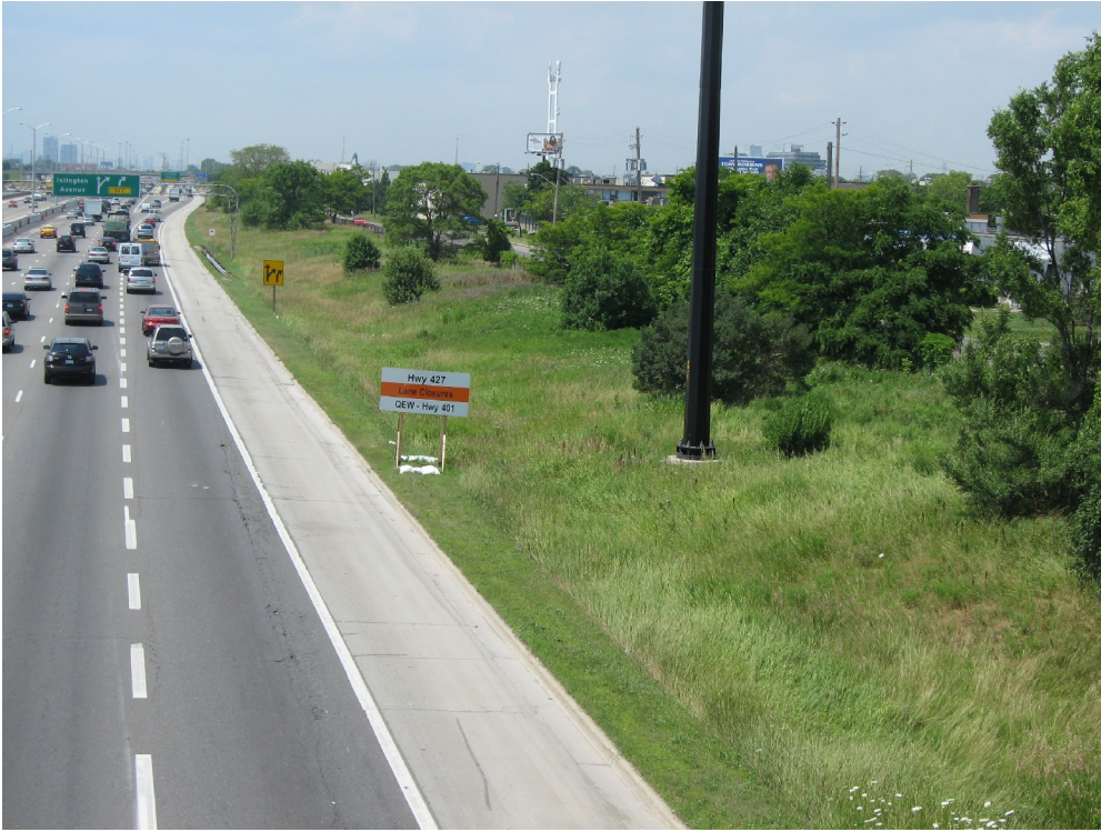
View from Top of Royal York Bridge