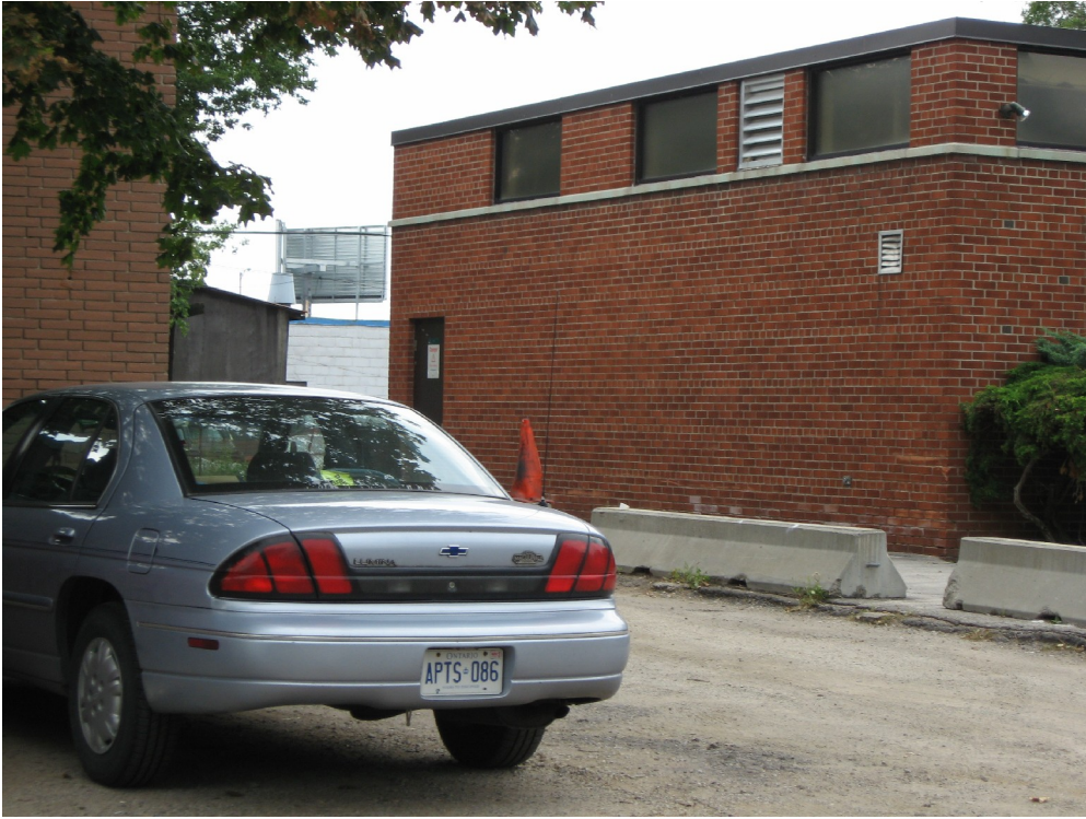
View from Dayton Ave. and Sinclair St.