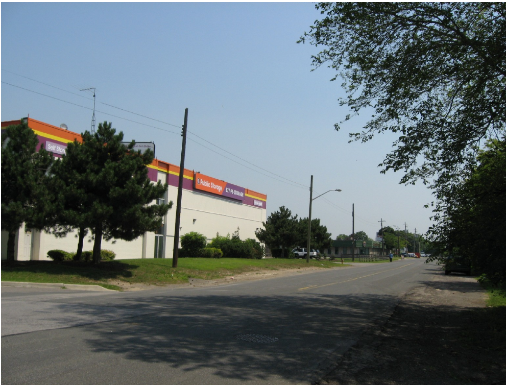
View from Taymall Ave. and Queen Elizabeth Blvd – Westbound