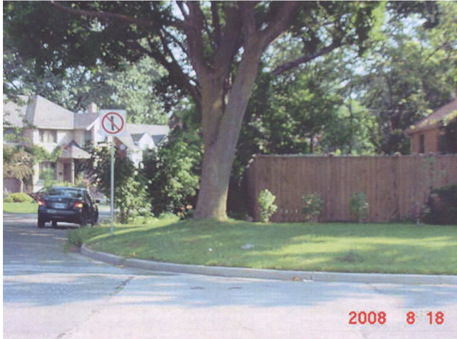
South East Flankage View of Fence