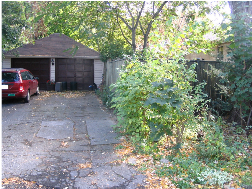
East Elevation Fence Enclosure Attachment 3