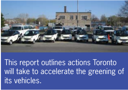
This report outlines actions Toronto will take to accelerate the greening of its vehicles.