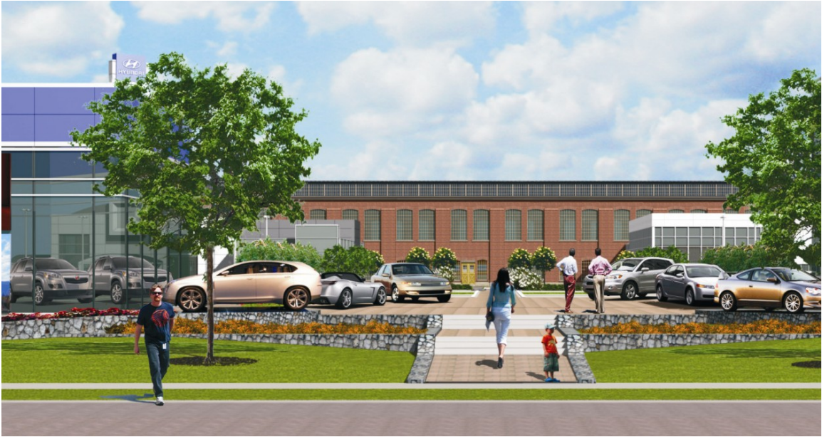
View from Laird Drive