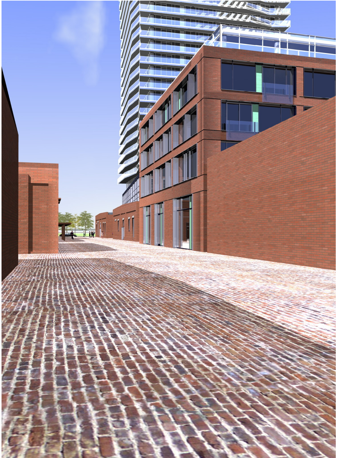
Looking east on Tank House Lane to new five storey podium building replacing Rack House M