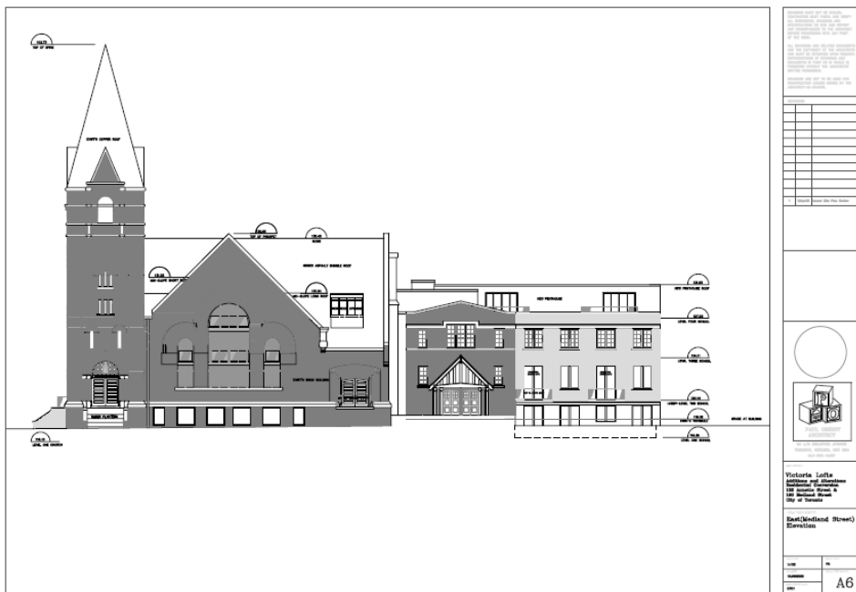
Medland Street East Elevation