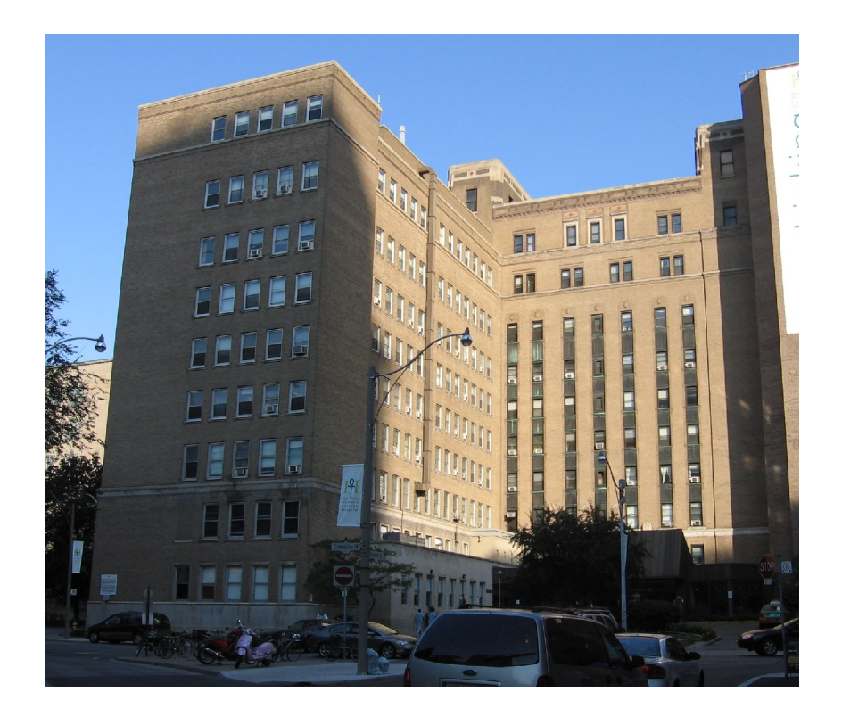
1935 hospital (centre) and 1956 south wing (left)