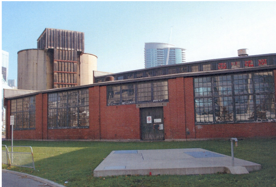
Outer Exterior Wall