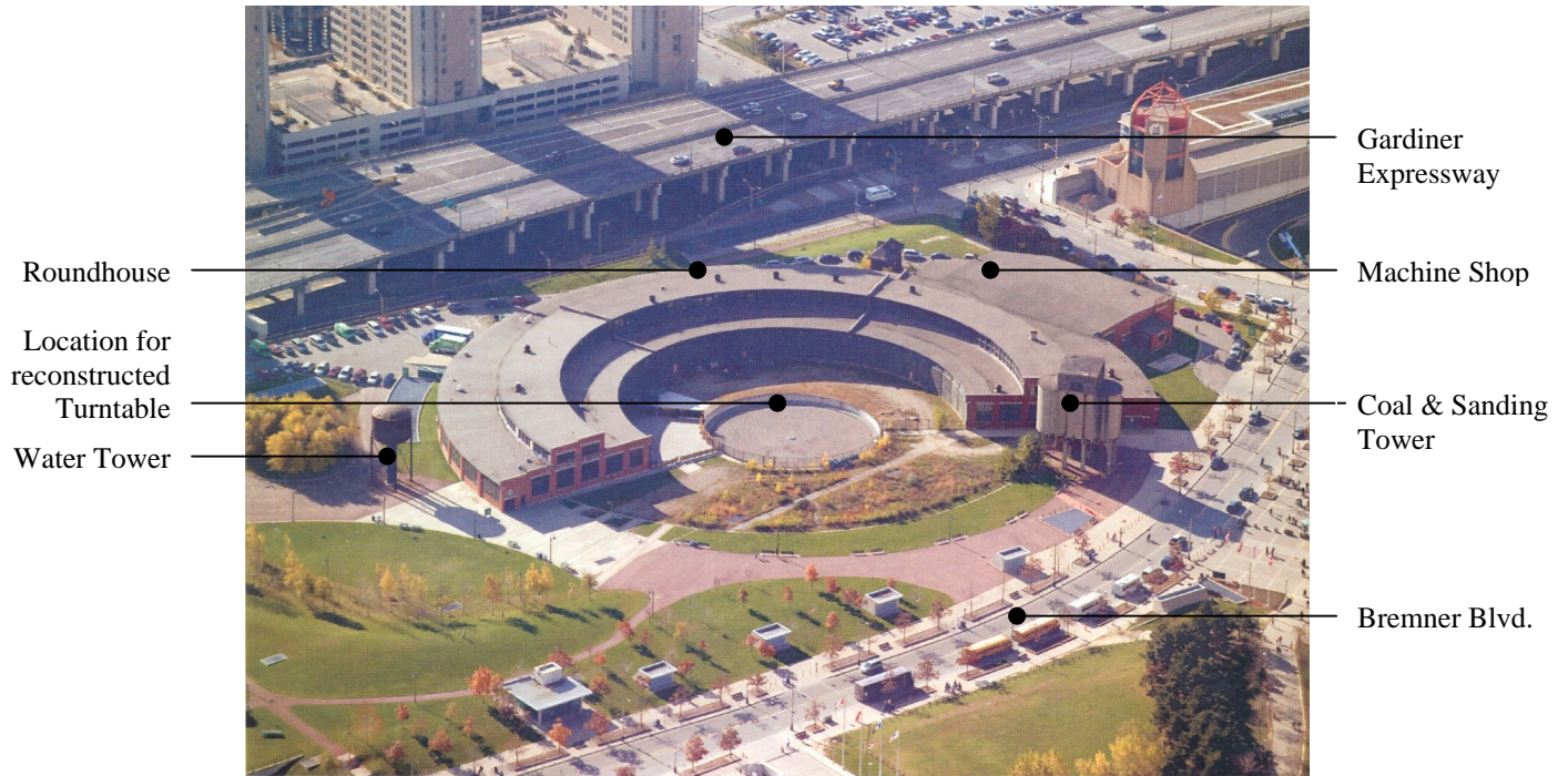
Aerial View from north east