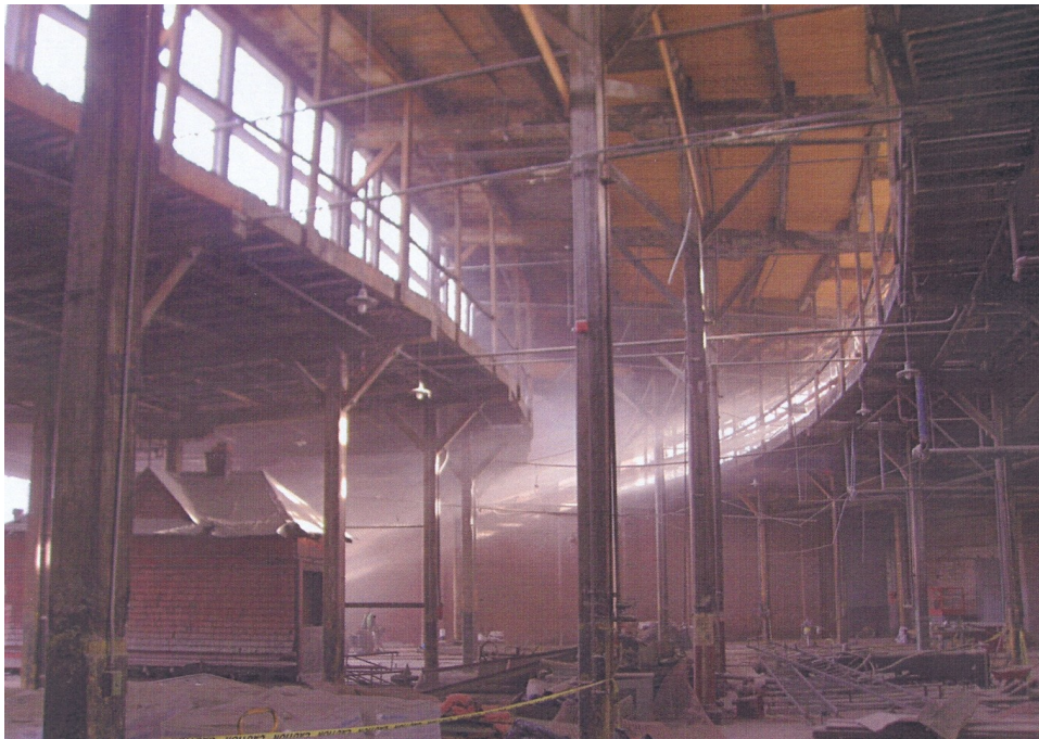
Typical Interior Volume