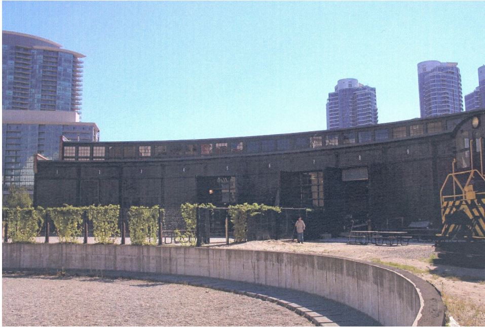
Inner Train Door Wall