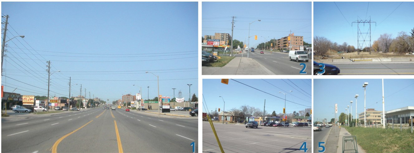
Figure 3.8: Street Character