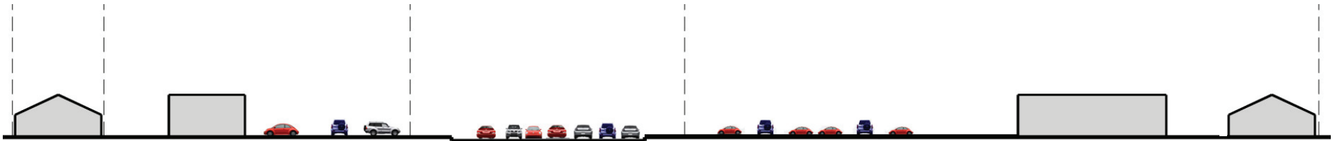
Figure 3.7: Lawrence Street Section at Pharmacy Avenue looking East (N.T.S.)

The lane widths, along with the few signalized pedestrian crossings, the lack of buildings along the street edge, the lack of street tree planting and high speed traffic contribute to an inhospitable environment for pedestrians (see Figures 3.7 and 3.8).