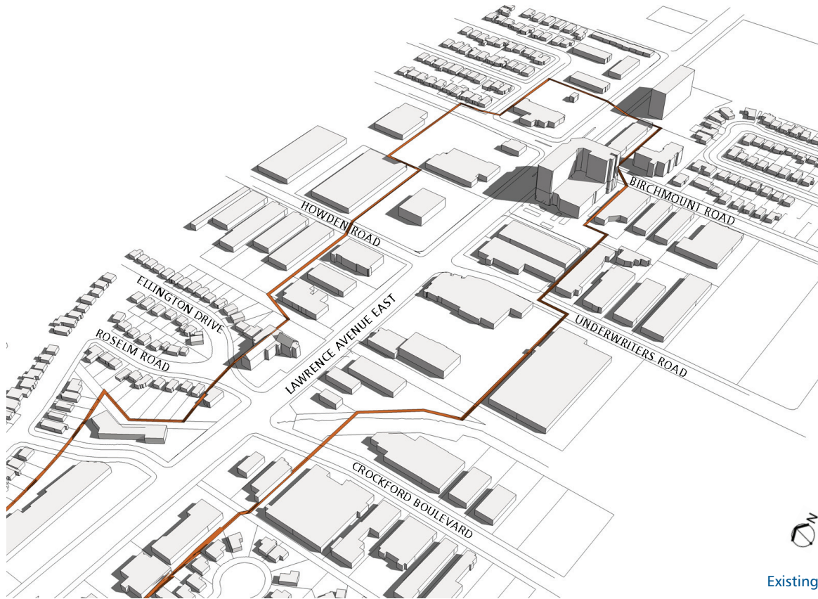
Existing Condition Bird's Eye View from Southwest