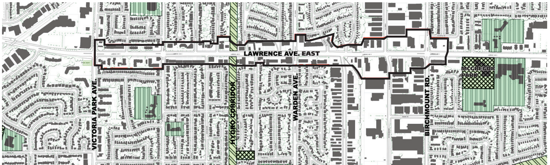
Figure 3.9: Existing Parks, Open Space and Tree Coverage, N.T.S.

Otherwise, parks and open spaces are scarce along Lawrence Avenue East and located far from the Study Area. There are no pedestrian linkages from Lawrence Avenue East to the larger trail system or greenways in the wider community. As already mentioned, all of the area north of Lawrence Avenue East and the area south of Lawrence Avenue East, between Warden Avenue and Birchmount Road, is defined as a park-deficient area in the City's Official Plan.