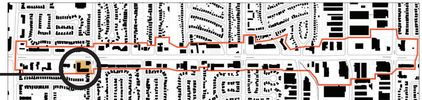
YOUNG + WRIGHT ARCHITECTS INC.