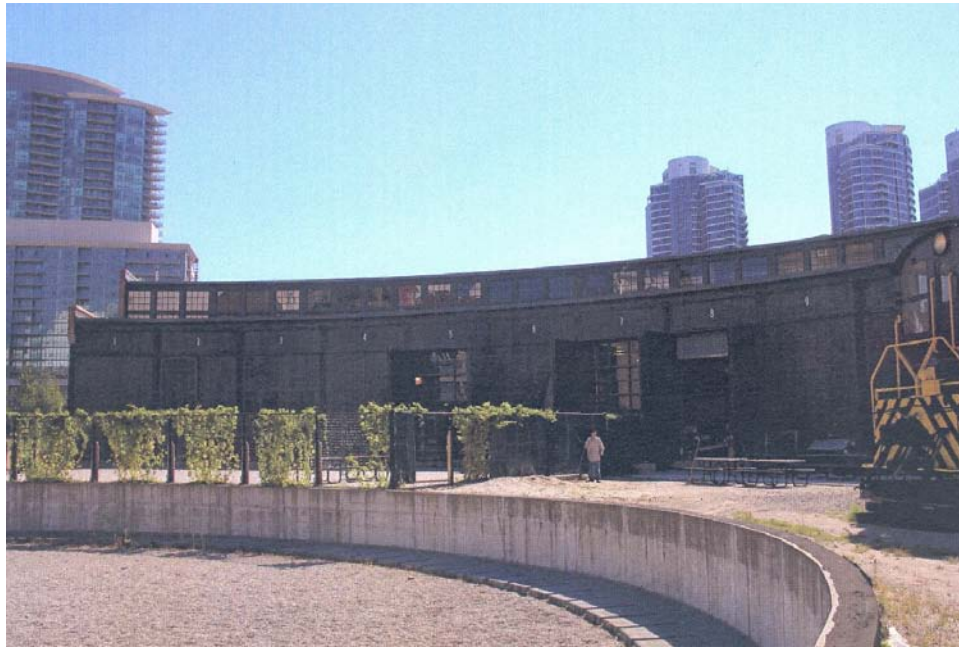
Inner Train Door Wall