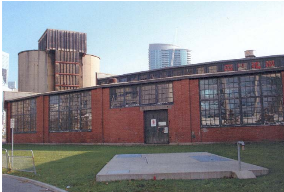
Outer Exterior Wall