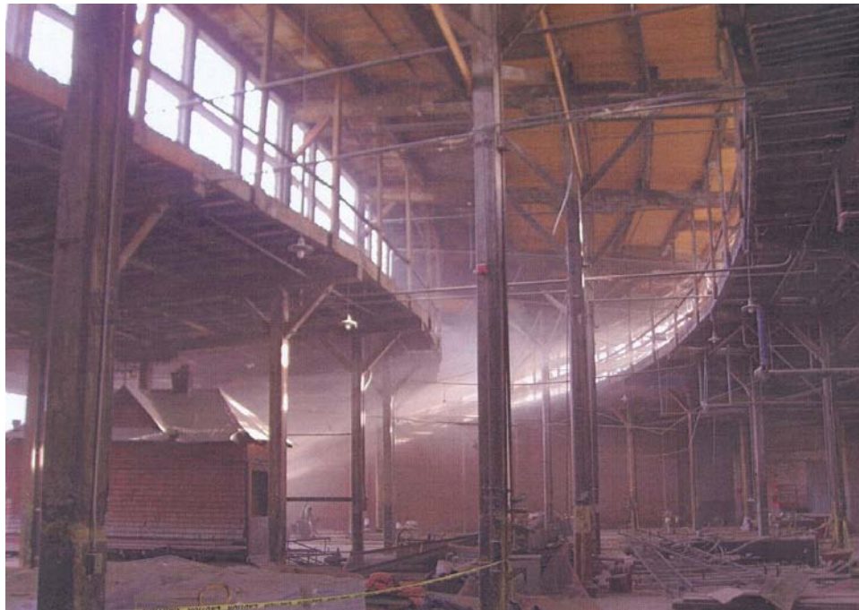
Typical Interior Volume