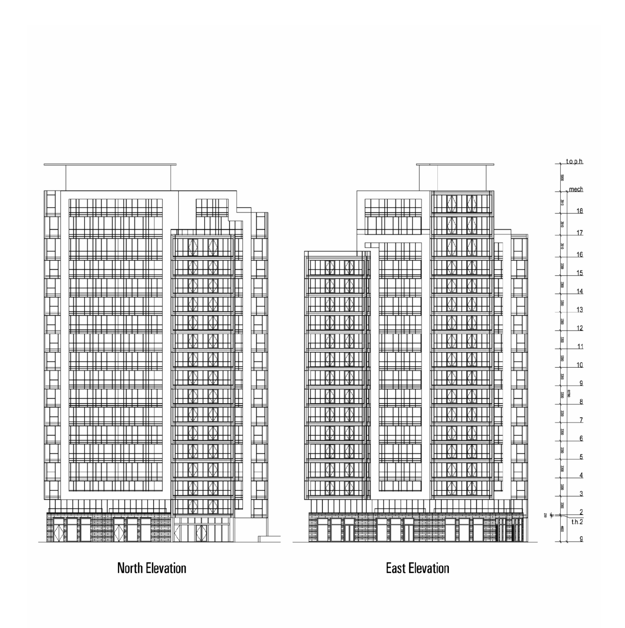
Attachment 4: North and East Elevations