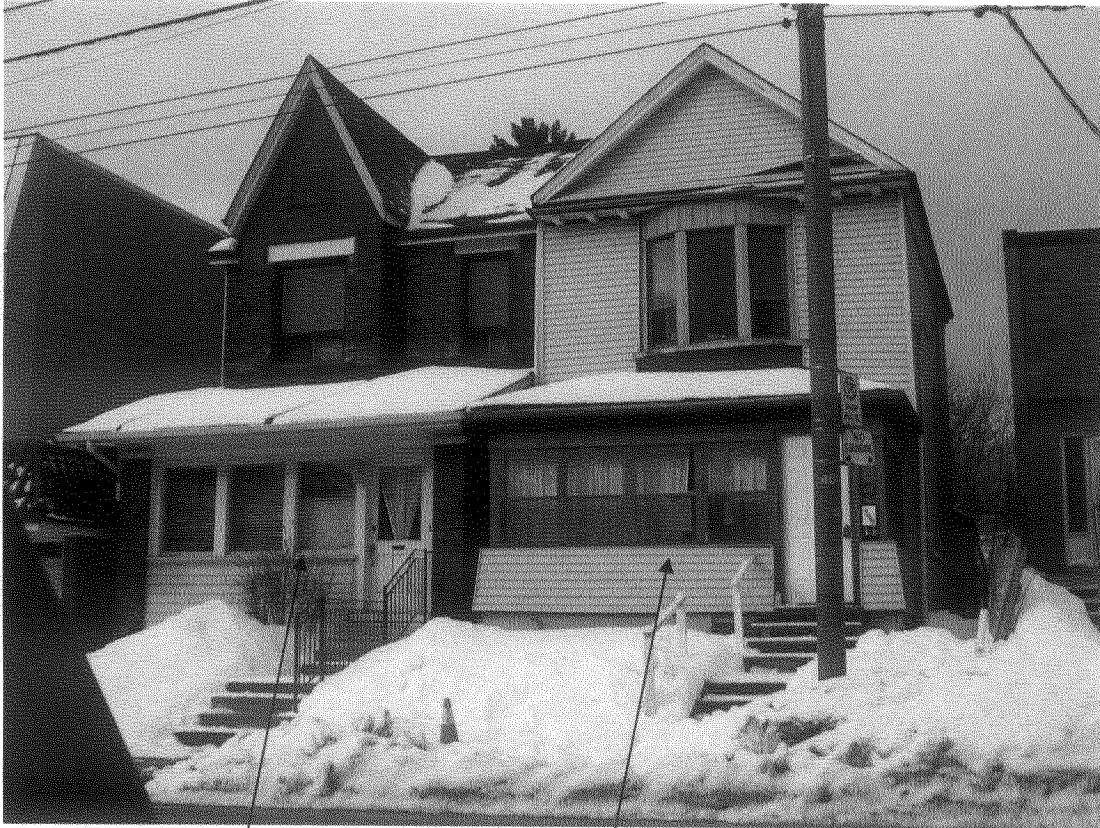
132 Coxwell Ave