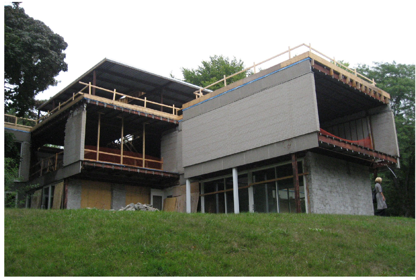
Figure 4a: VIEW OF RAVINE SIDE: photo taken in Fall 2007