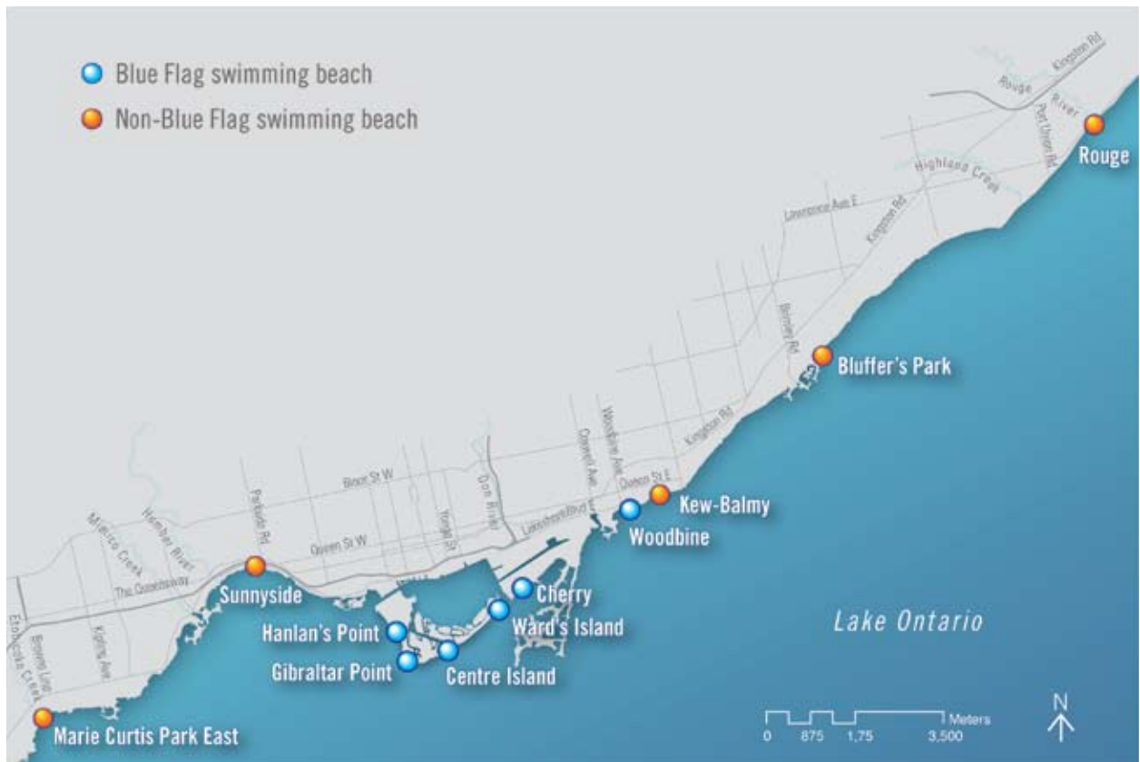
FIGURE 1. Toronto's Designated Swimming Beaches, 2008

provincial standard – is a good indicator of beach quality and, more specifically, of beach water quality. Summary numbers from 1999 to 2008 display a cyclical rise-and-fall in beach openings (fig. 2). Rolling five-year averages during this period show a steady improvement in overall beach performance, from 51% open in 1999-2003 to 67% open in 2004-08. The yearly change from 2004 to 2007 is impressive: total beach openings were up 39 percentage points, reaching a record high of 82% open in 2007. This can be attributed partly to the weather – 2007 was Toronto's driest summer since 1959 – and partly to improved water management. The slight dip in 2008 likely reflects Toronto's wettest summer since 1937.