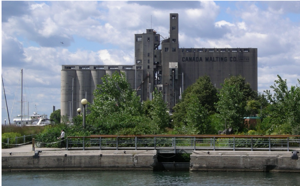
View of the east side of the Canada Malting complex, showing the 1929 (left) and 1944 elevators (right)