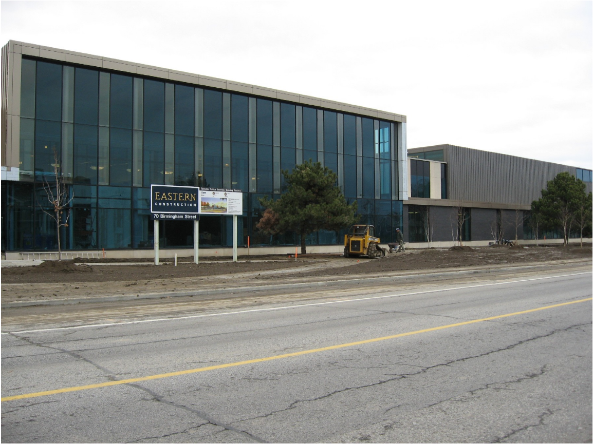
70 Birmingham Street