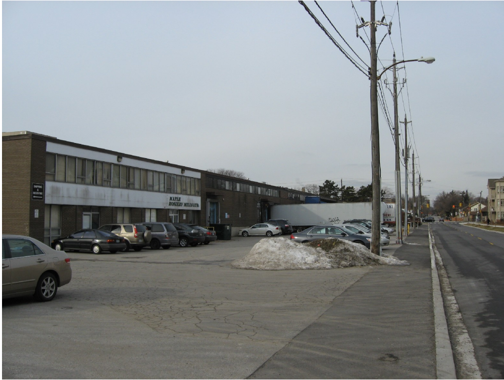
West side of 5 Pine St across the street from 5 Pine looking north