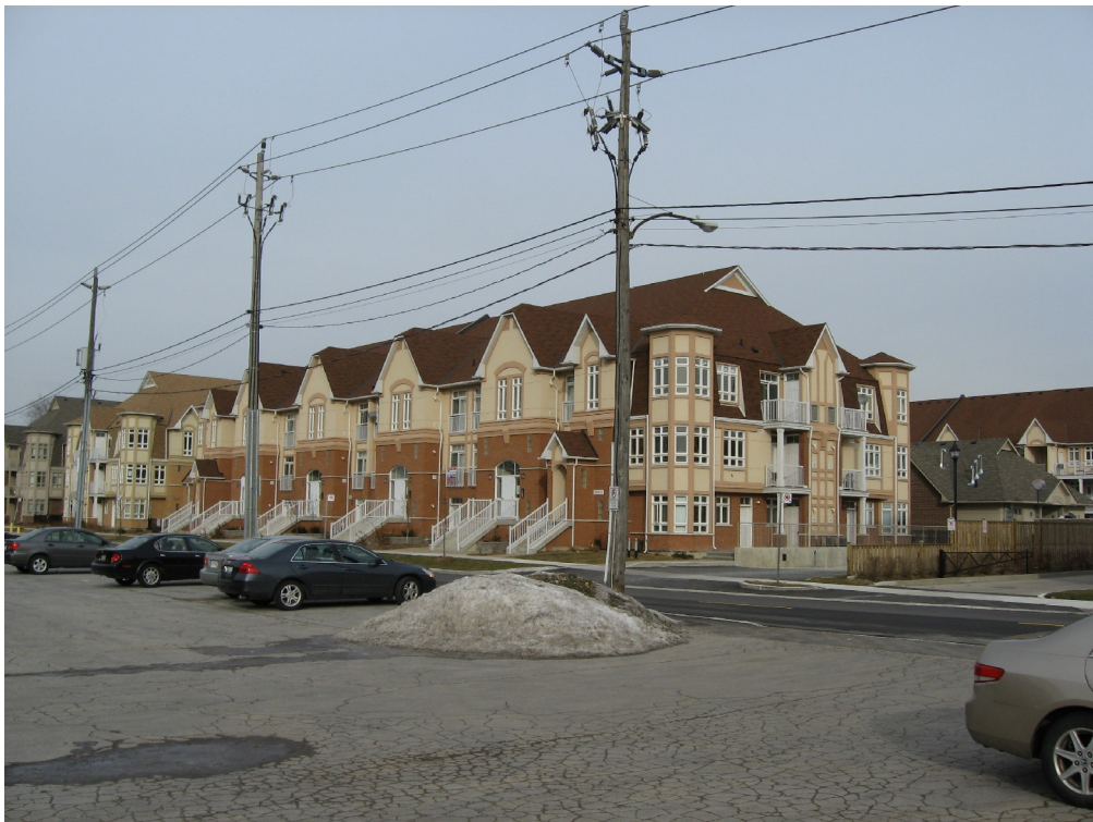
East side of 5 Pine St looking north from 5 Pine