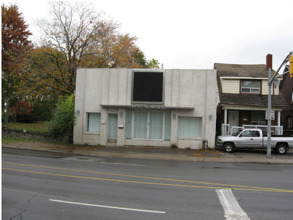
South Elevation of 2387 Weston Rd with LED screen attached to building