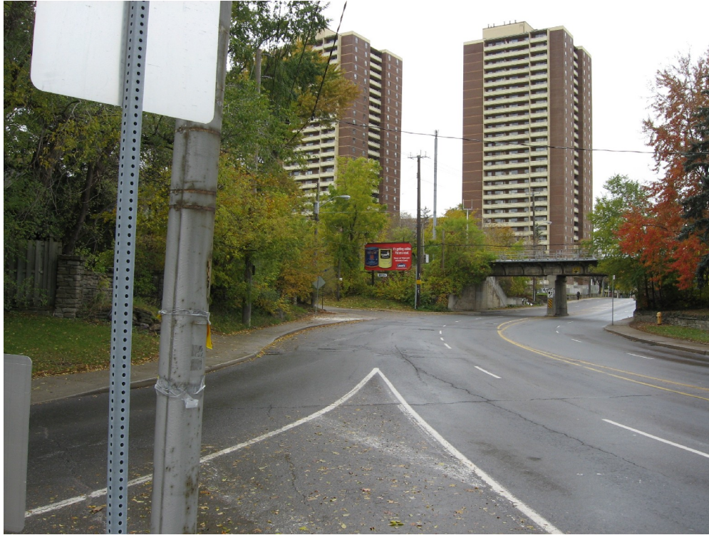
Looking west from 2387 Weston Rd at existing 3 rd party sign