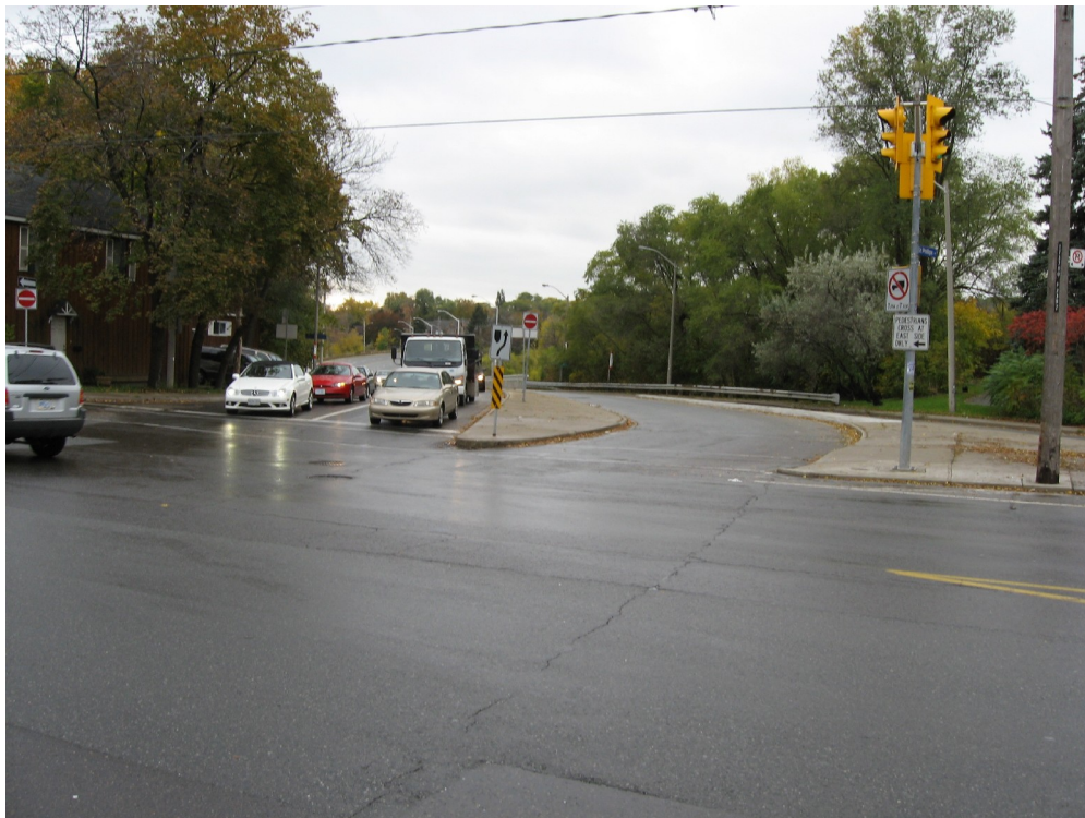
Looking south down St Philips Rd from 2387 Weston Rd