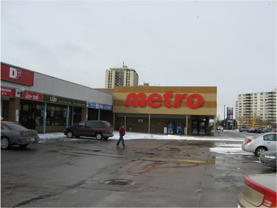
East elevation of the grocery store. The “METRO” sign is the subject of this report.