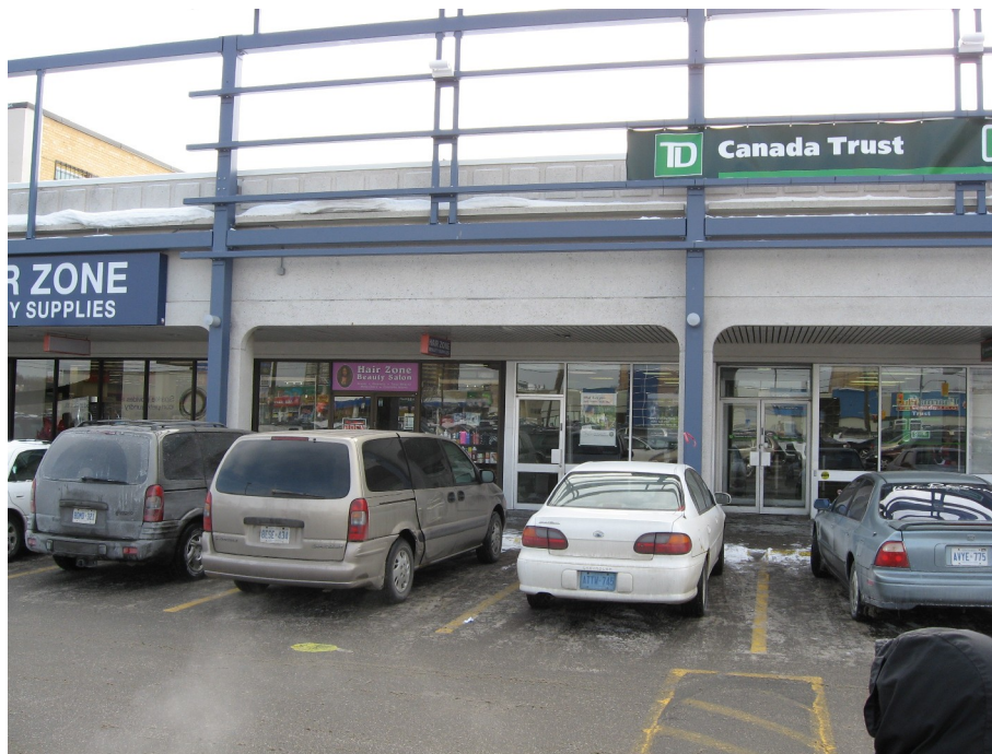
Temporary banner sign marks the location of proposed illuminated first party Canada Trust Sign