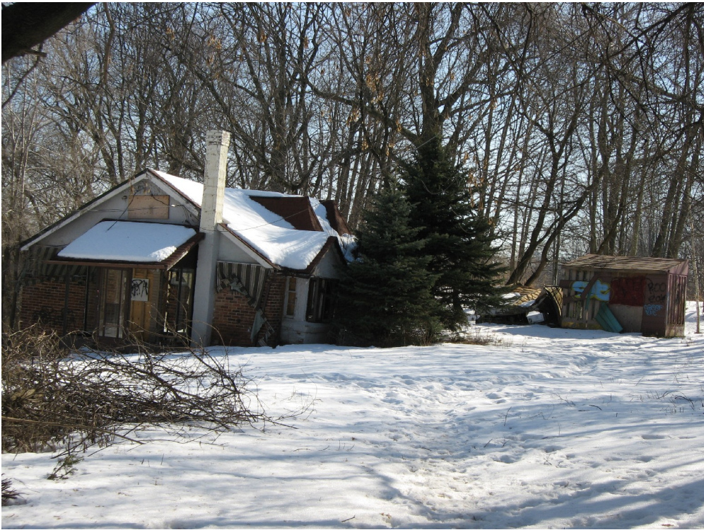
55 Oakfield Drive