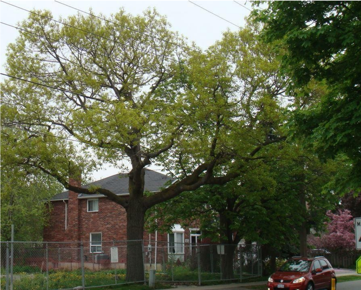
Red oak tree