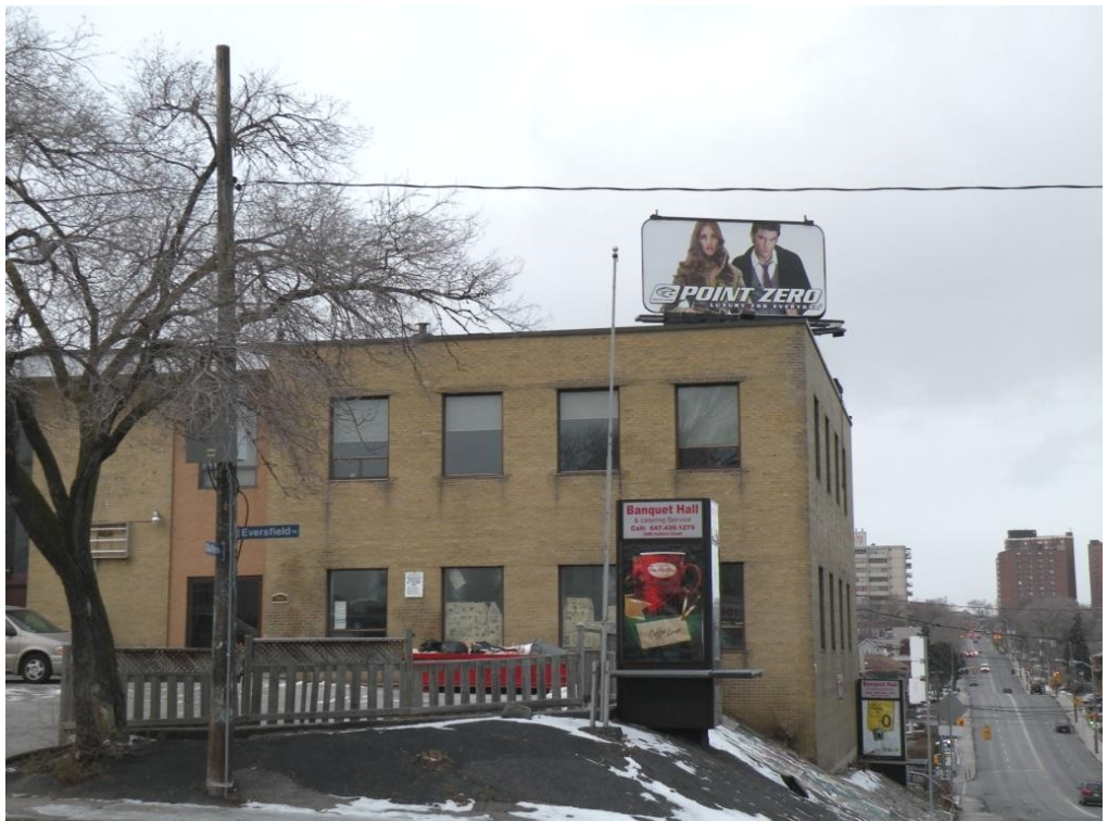
Attachment 2: Photos of the Billboard Sign at at 2080 Dufferin Street