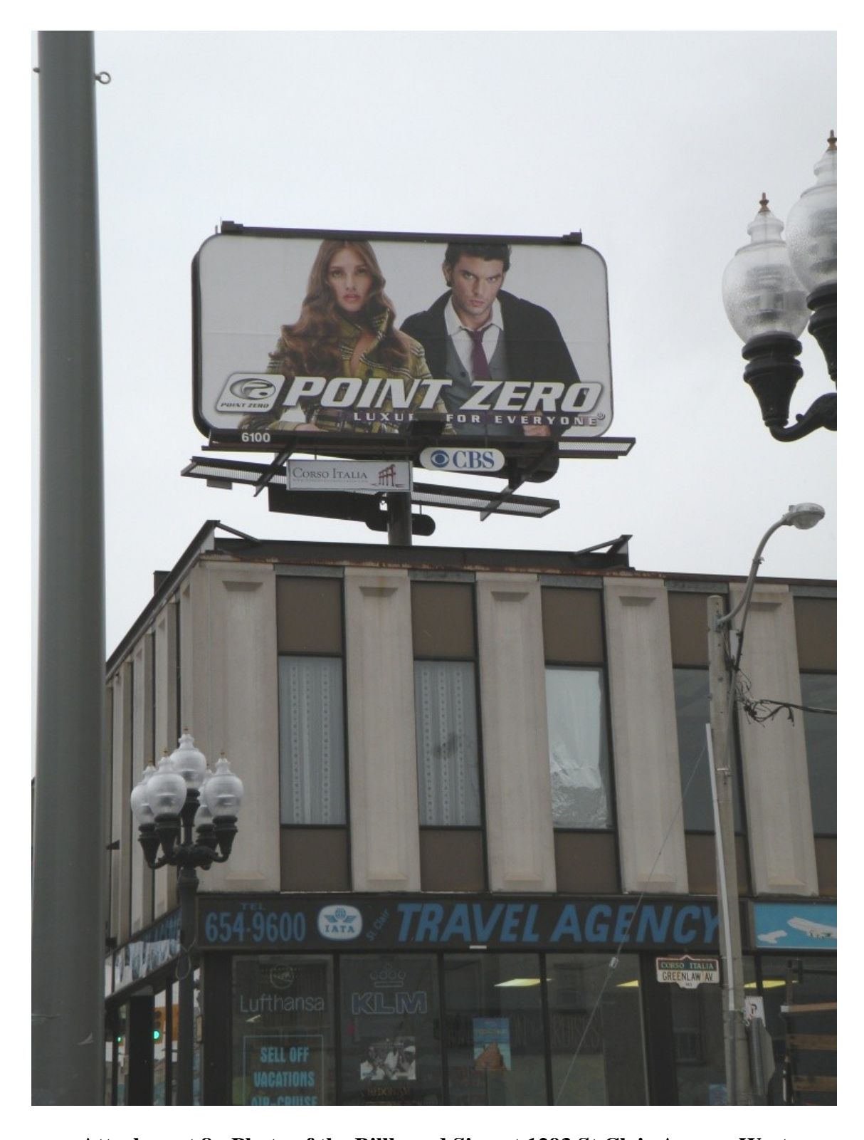
Attachment 8: Photo of the Billboard Sign at 1293 St Clair Avenue West