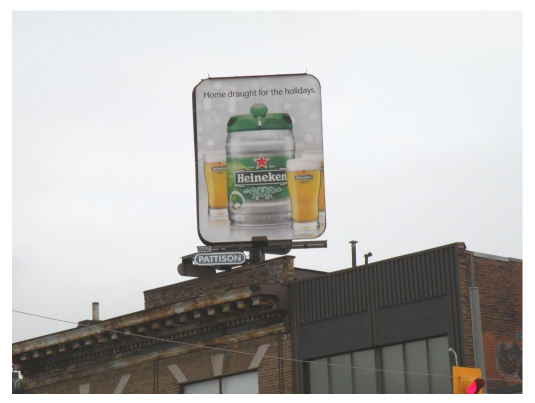
Attachment 5: Photos of the Billboard Sign at 1163 St Clair Avenue West