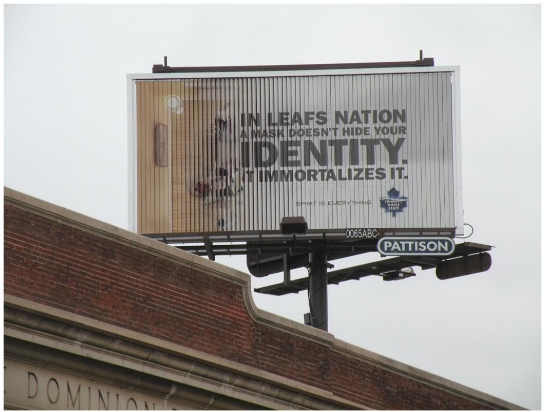
Attachment 9: Photos of the Billboard Sign at 1169 St Clair Avenue West