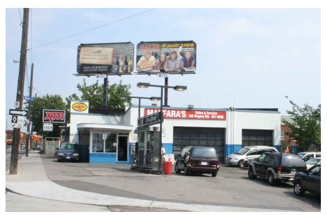
Attachment 1: Photos of the Billboard Signs at 165 Rogers Road