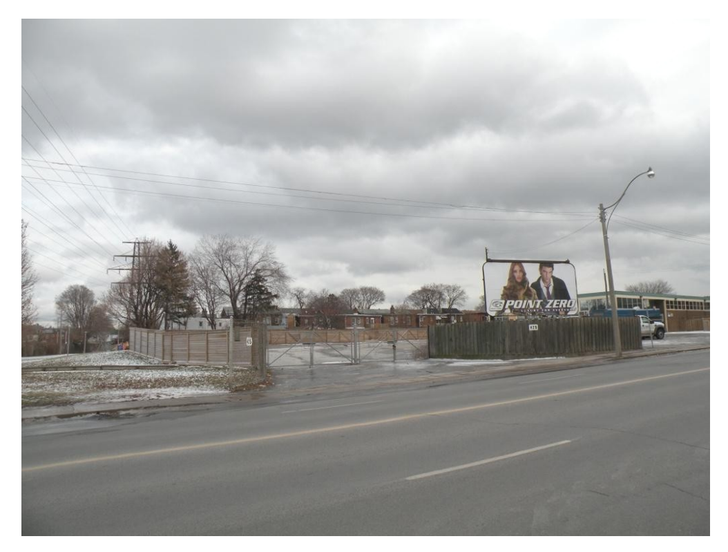
Attachment 7: Photos of the Billboard Sign at 423 Old Weston Road