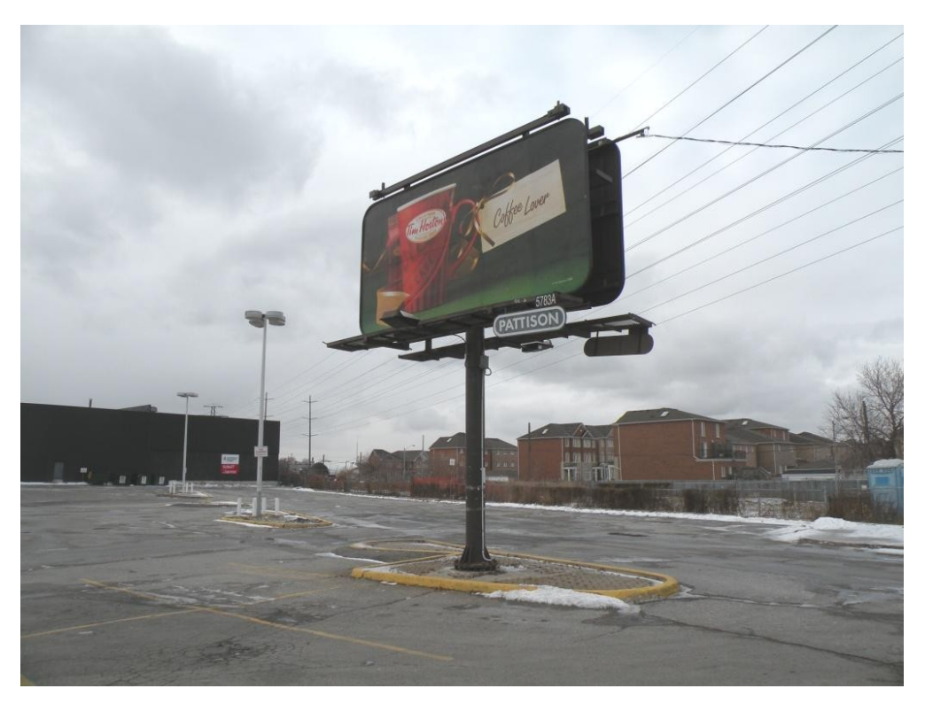
Attachment 6: Photos of the Billboard Signs at 404 Old Weston Road