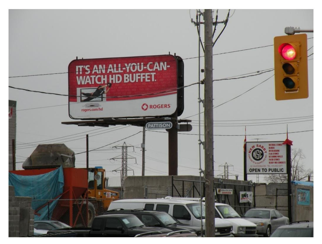
Attachment 10: Photos of the Billboard Signs at 32 Caledonia Road