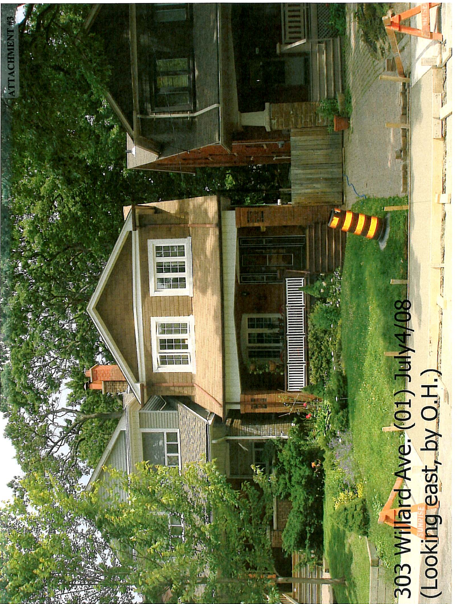
303 Willard Ave. (01) July 4/08 (Looking east, by O.H.)