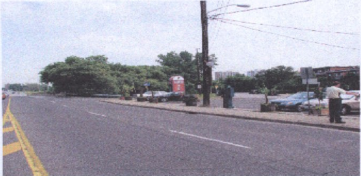
271 Scarlett – After