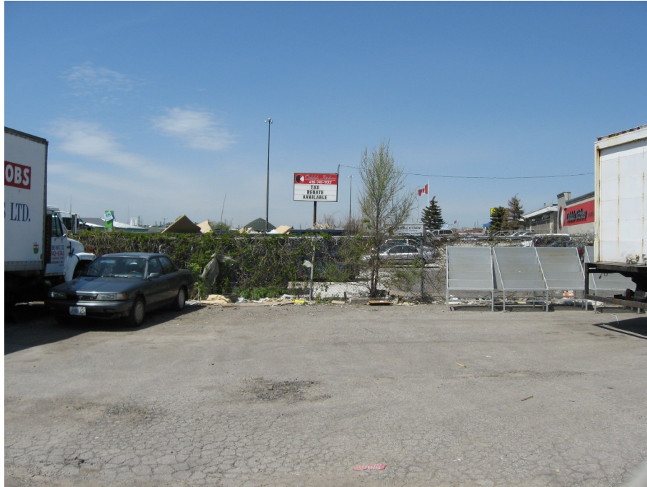
Looking north from 84 – 86 Oakdale Rd. Highway 400 runs parallel to the rear lot line that is on the left hand side of the picture.