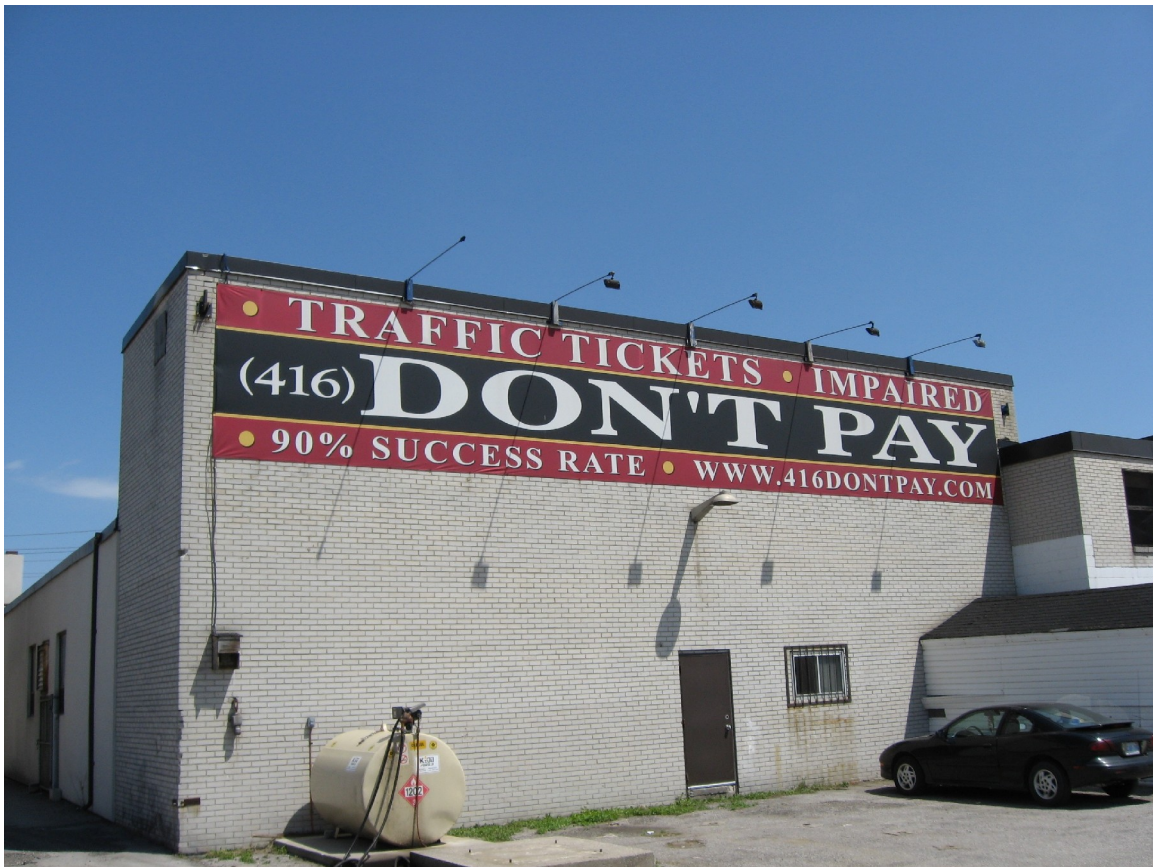
Rear elevation of building at 84 – 86 Oakdale Rd