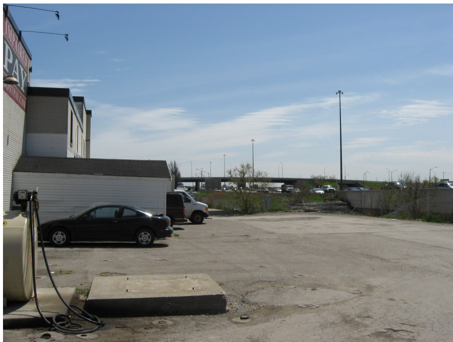
Looking north from 84 – 86 Oakdale Rd. Highway 400 runs parallel to the rear lot line that is on the right hand side of the picture.