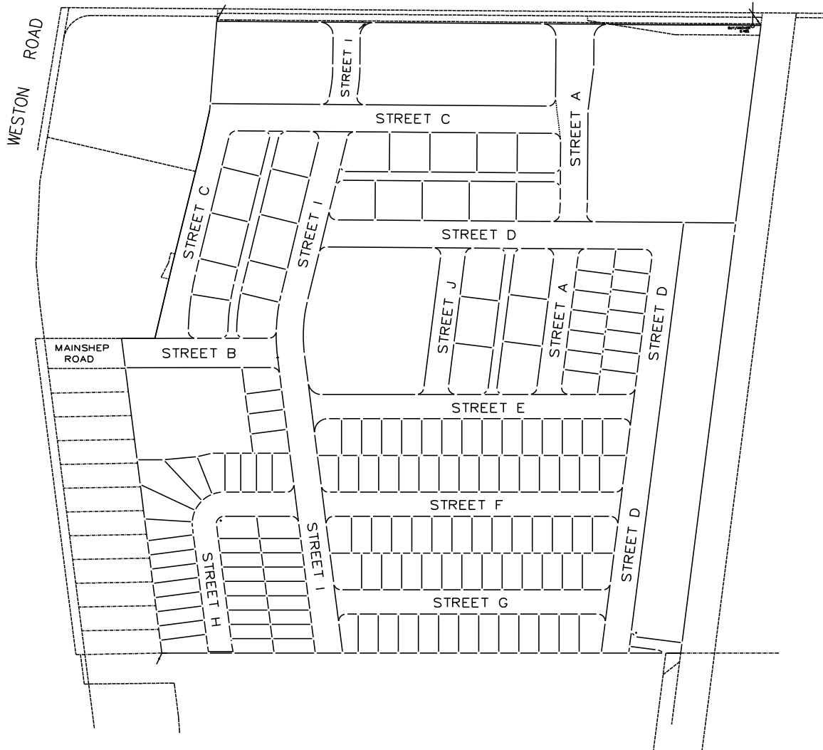
DRAFT PLAN OF SUBDIVISION AT 2277 TO 2295 SHEPPARD AVENUE WEST