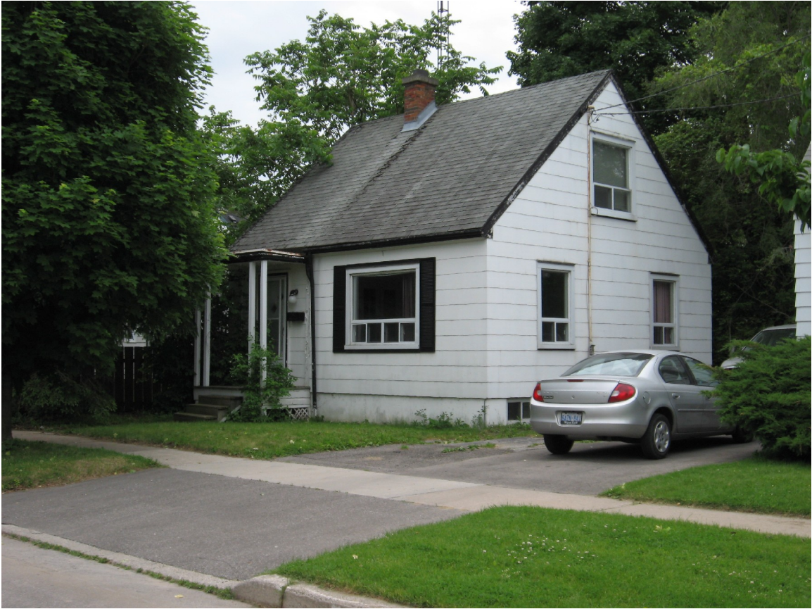
Front elevation at 25 The Wishbone