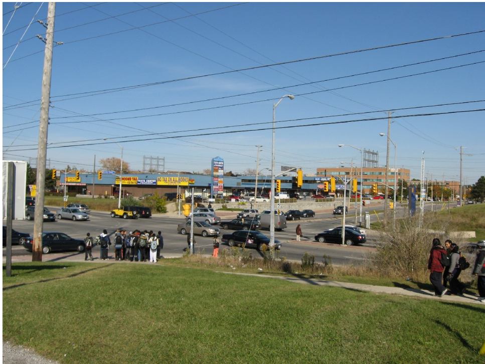
North-east corner of Hwy 27 & Humber College Blvd