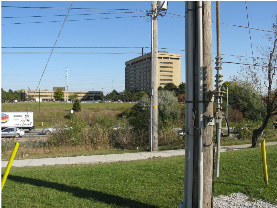
South-east corner of Hwy 27 & Humber College Blvd. Etobicoke General Hospital in the background