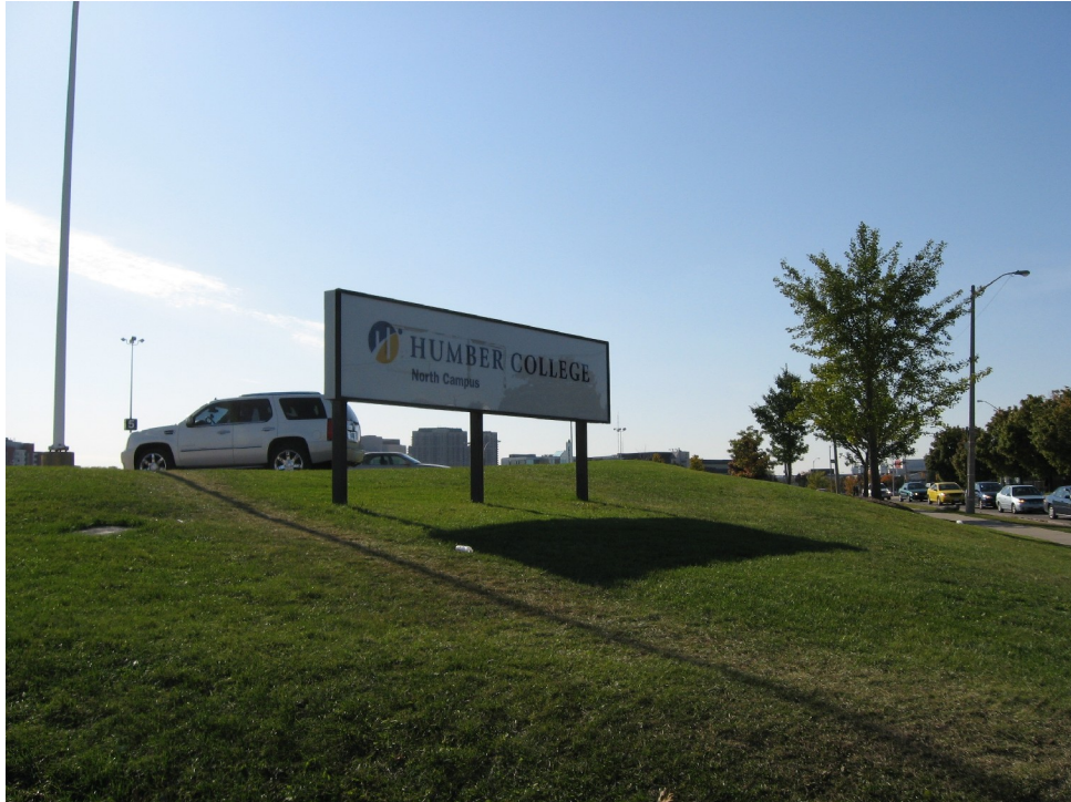
Existing sign that is to be replaced with the proposed sign.