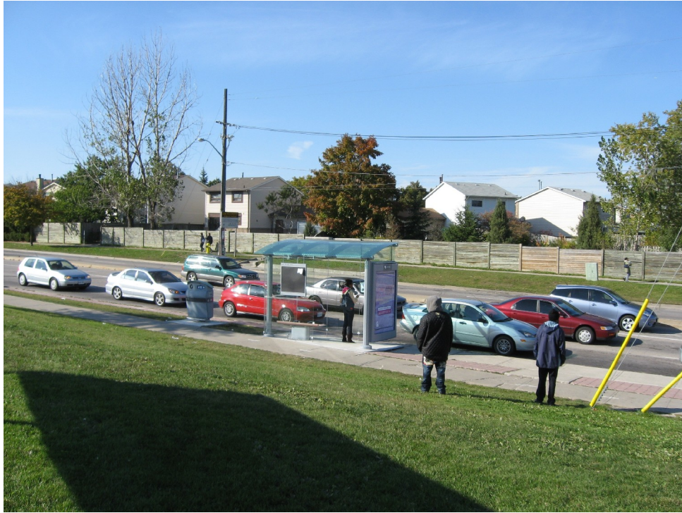
North-west corner of Hwy 27 & Humber College Blvd