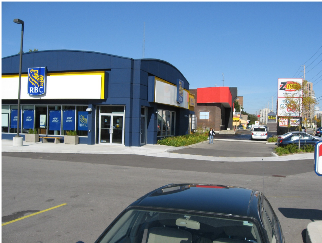
The west & south elevations of the bank building. The red canopy in the back ground is the existing radio station. The radio stations illuminated ground sign can be seen in the background.