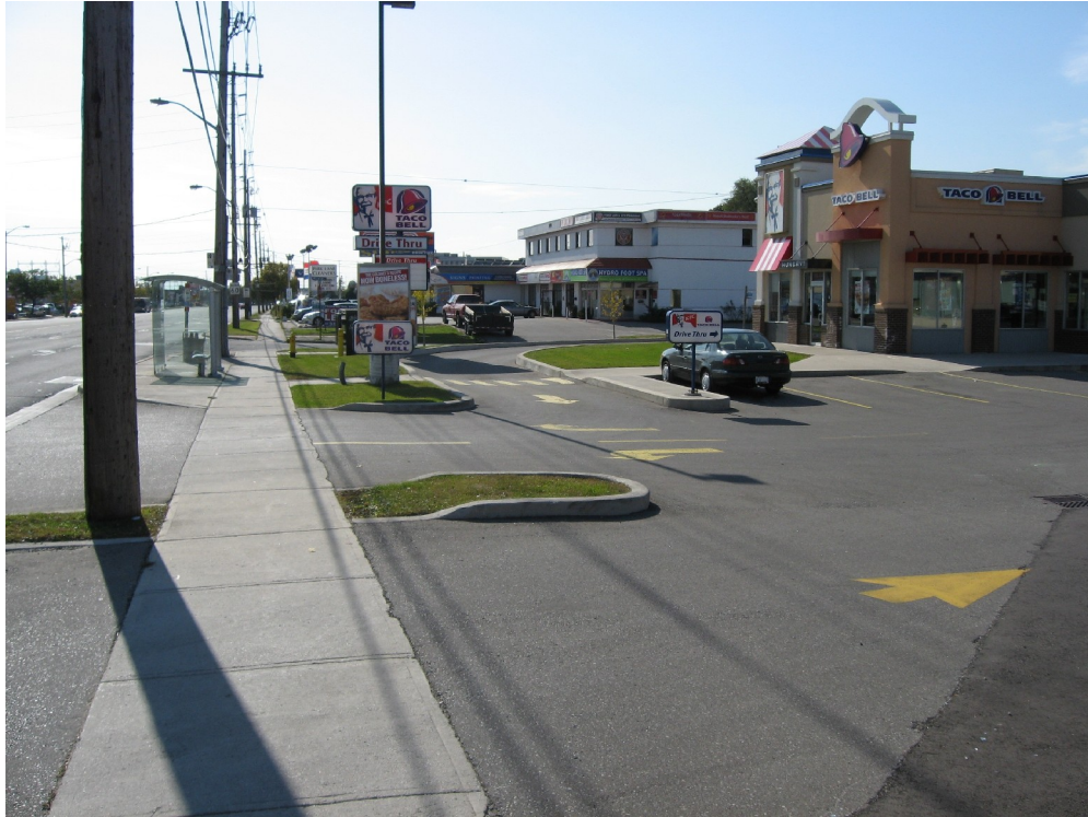
KFC/Taco Bell restaurant at the corner of Dundas St W and Wilmar Rd