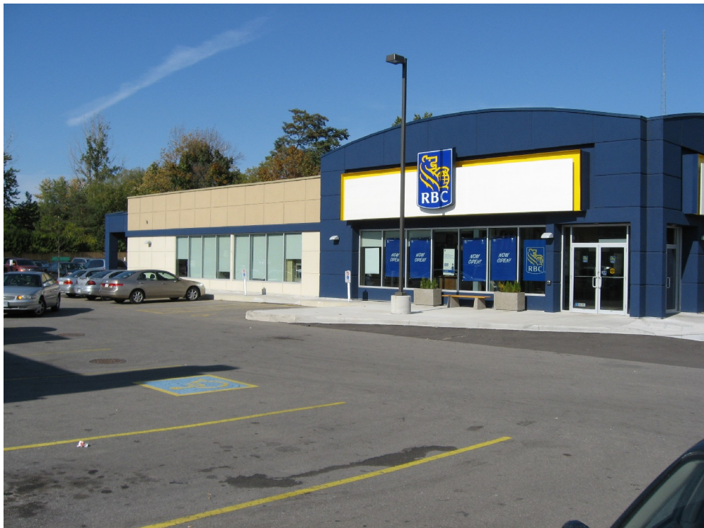
West elevation of RBC bank building