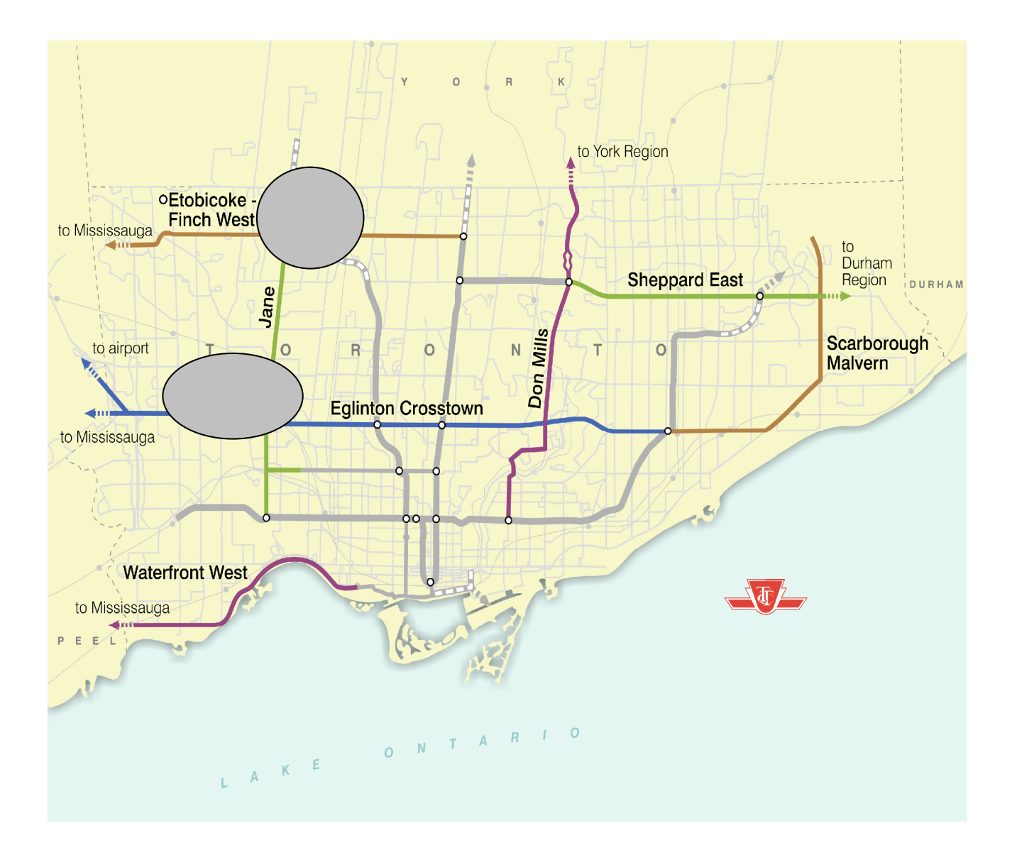
Appendix "A' MSF Sites Recommended Location