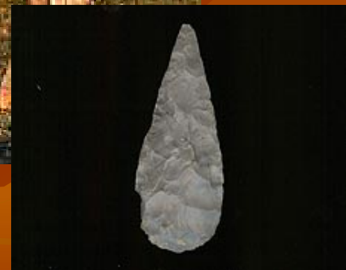
Iroquoian longhouse & Archaic arrowhead