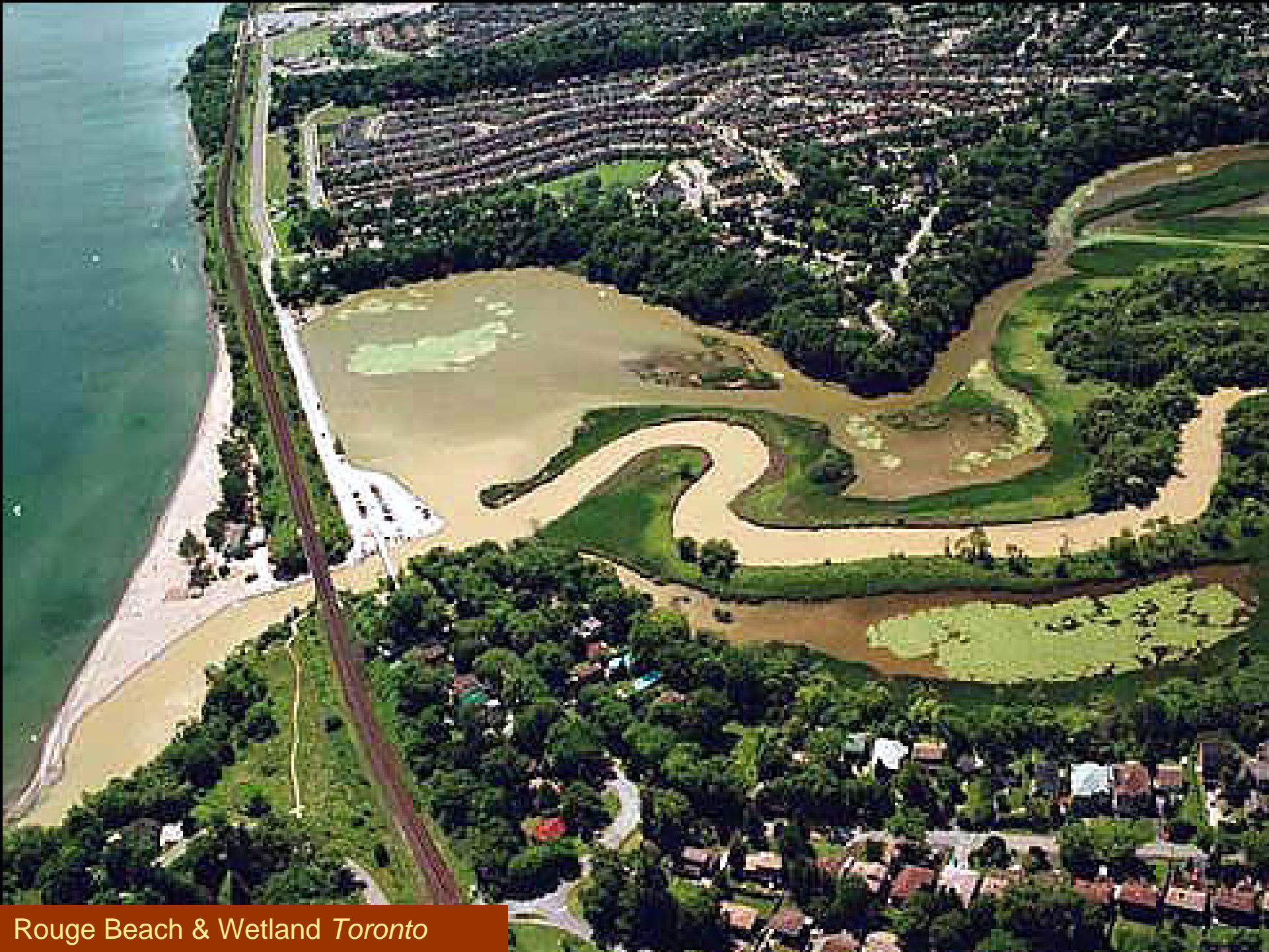
Rouge Beach & Wetland Toronto