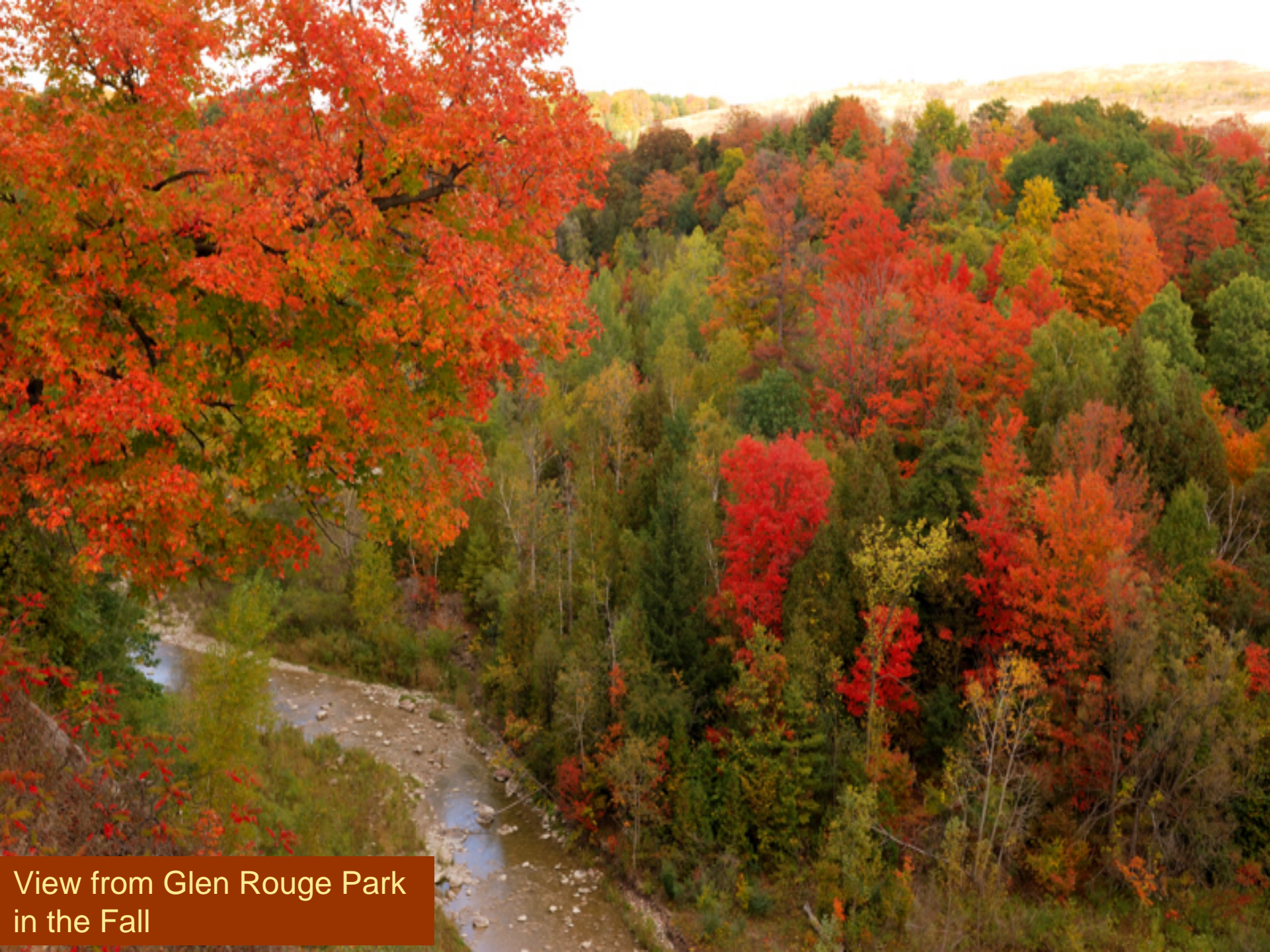
View from Glen Rouge Park in the Fall