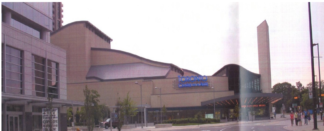
ATTACHMENT 3 - EXISTING EAST WALL OF 5040 YONGE ST