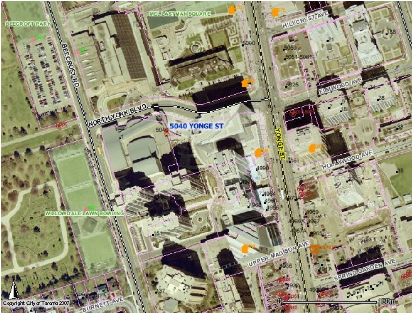
ATTACHMENT 2 - SATELLITE IMAGE OF SITE