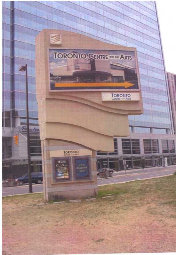
Existing Conditions -Pylon