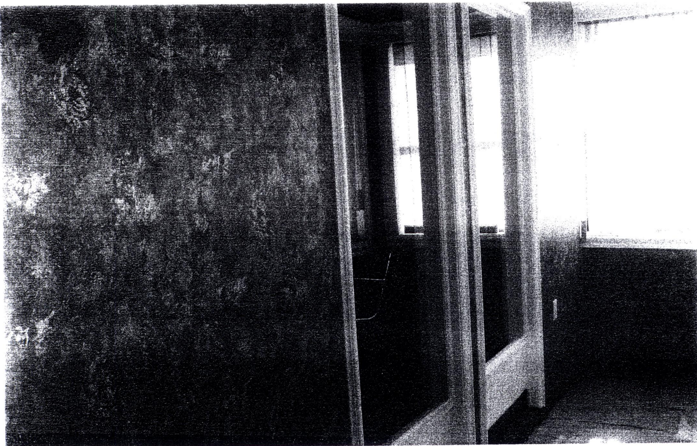
WEST FACADE - SOUTH

MALCOLM HOUSE - MISSING WEST WALLS - FRONT EXTERIOR WALL OPENINGS - ORIGINAL OPENINGS (WINDOWS) MISSING.