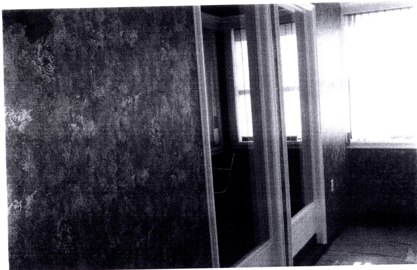
WEST FACADE - SOUTH

MALCOLM HOUSE - MISSING WEST WALLS - FRONT EXTERIOR WALL OPENINGS - ORIGINAL OPENINGS (WINDOWS) MISSING.