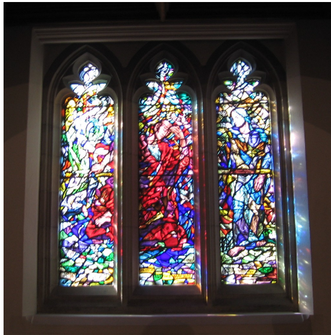
Chapel, showing the three-part window on south wall to be removed