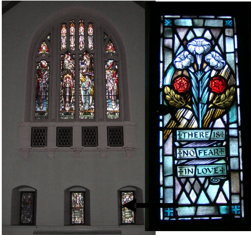
West Transept, showing three lower windows to be removed, with detail of one of three