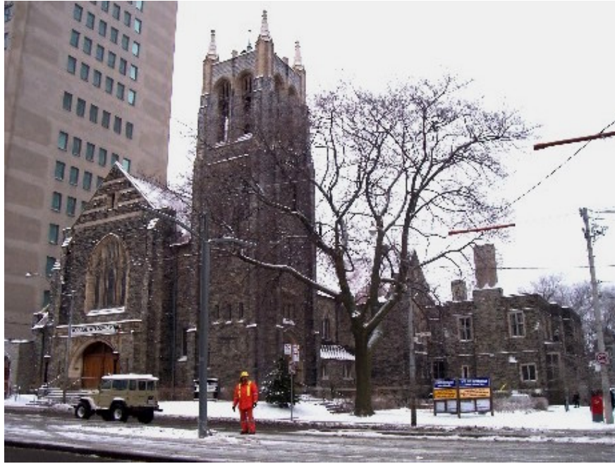
View of Deer Park United Church on the southeast corner of St. Clair Avenue West and Foxbar Road.