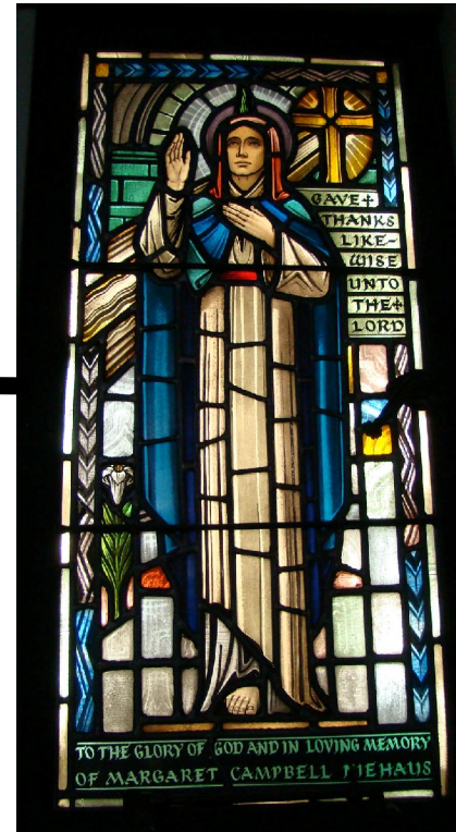
East wall of Church, with detail (right) of one of the six windows to be removed from the lower wall