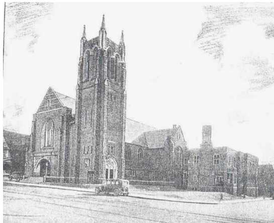
Archival views showing Deer Park United Church in 1931 (left) and after the addition of the Sunday School wing in 1931 (right).