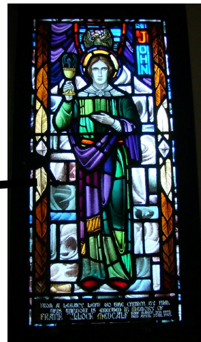
West wall of Church, with detail (right) of one of the four windows to be removed