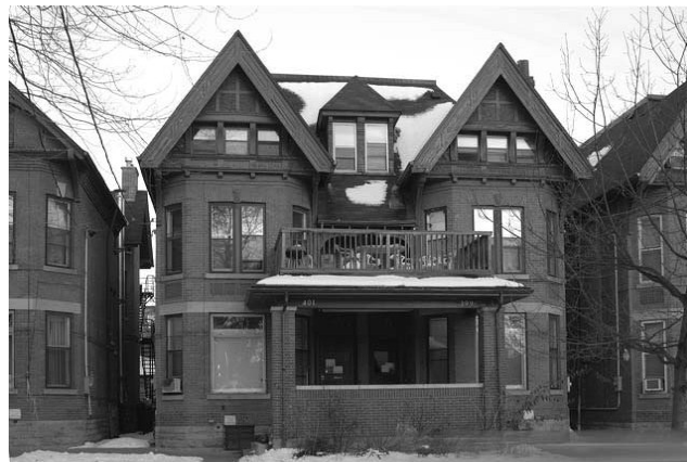
399-401 Huron Street