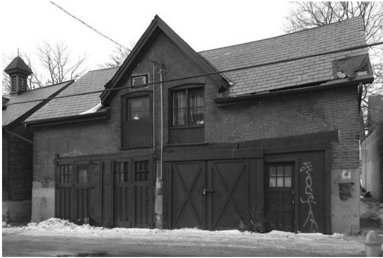
North Coach House: east wall facing bpNichol Lane