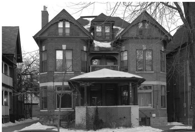
403-405 Huron Street