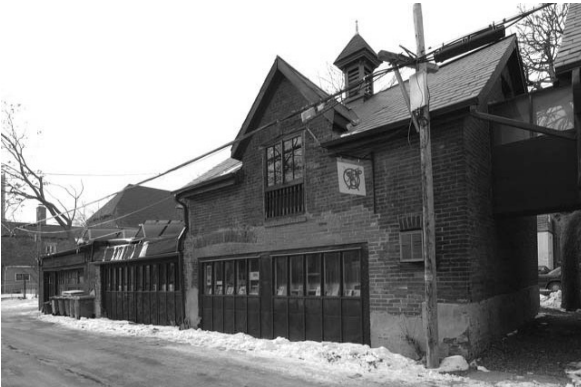
South Coach House: east wall facing bpNichol Lane