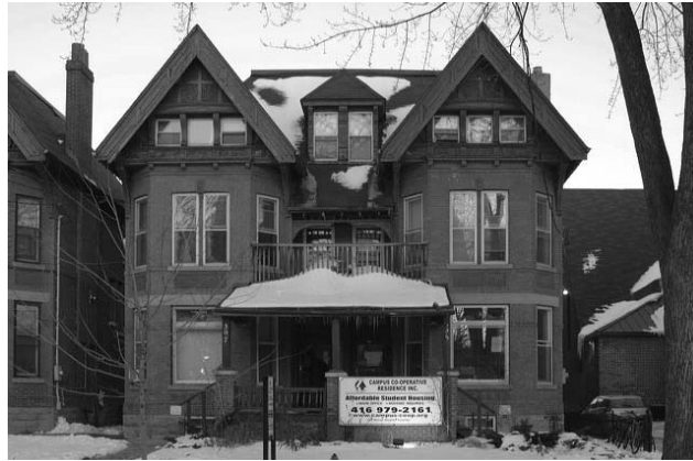
395-397 Huron Street