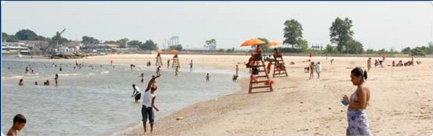
Orchard Beach, NYC