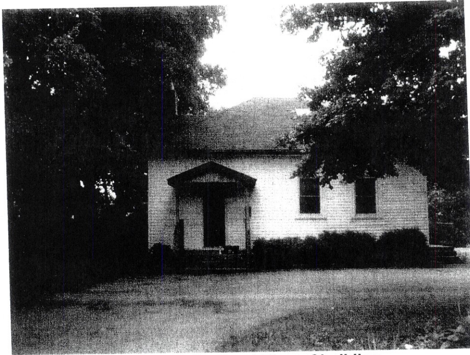
Photograph 1 – Front View of building.