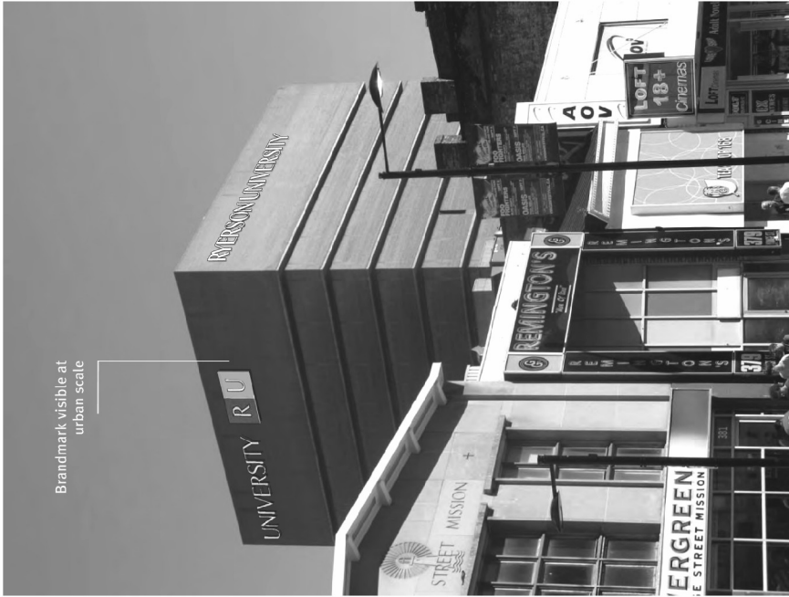
Brandmark visible at urban scale