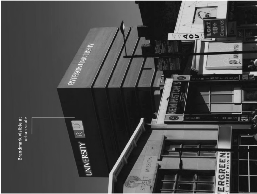
Brandmark visible at urban scale