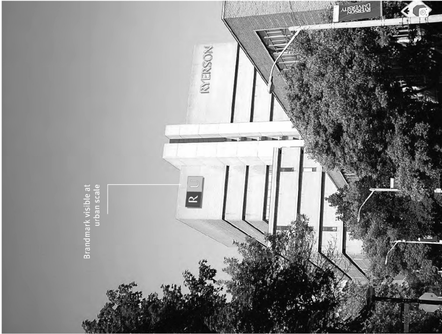
Library building - East elevation.