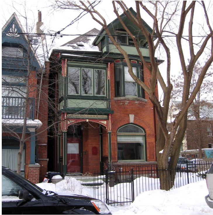
East façade on Beaconsfield Avenue