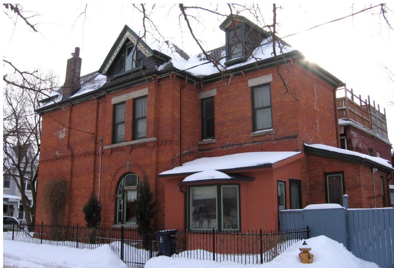
North Elevation on Collahie Street