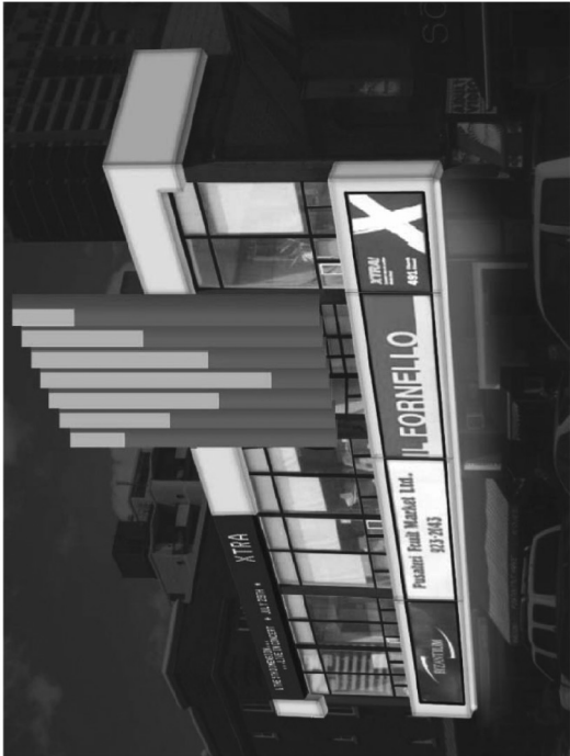
NIGHT TIME REPRESENTATION