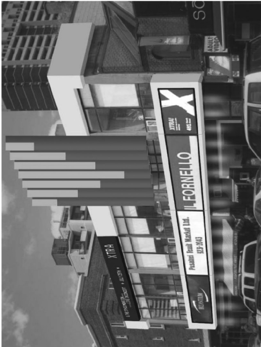
DAY TIME REPRESENTATION