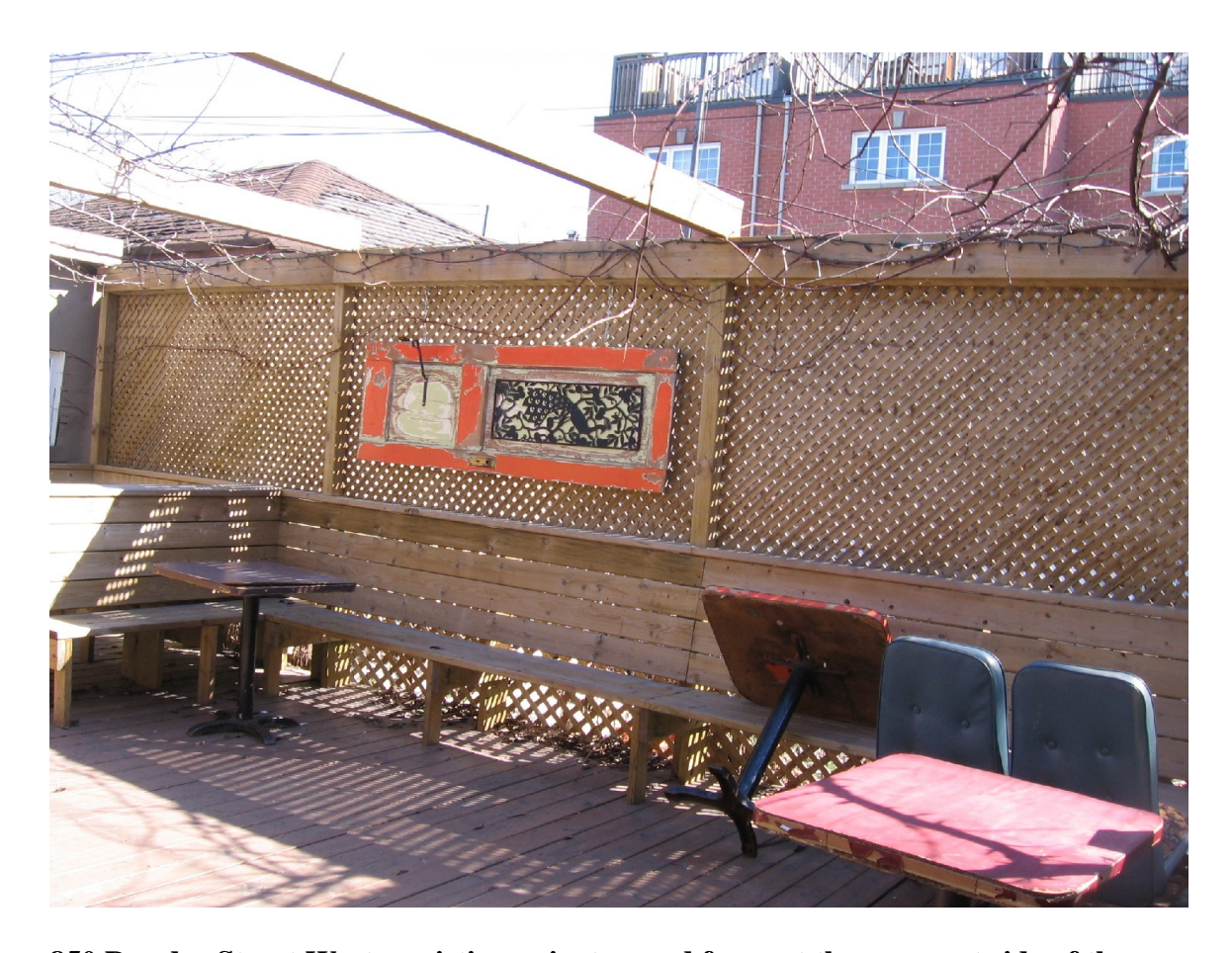
850\ Dundas\ Street\ West – existing private wood fence at the rear east side of the property