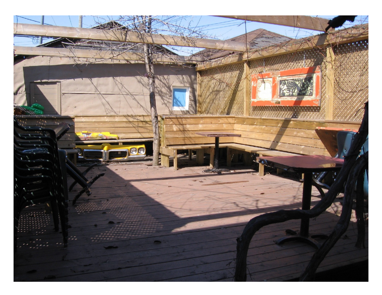
850 Dundas Street West – rear north side of the property (existing garage)