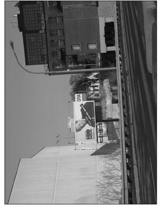
Attachment 1: Elevations