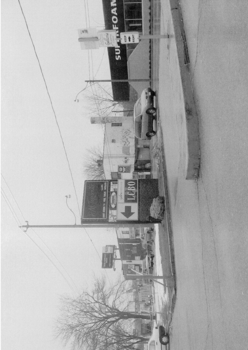
EXISTING PEDESTAL SIGN