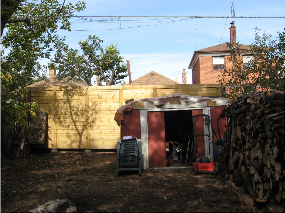
Attachment 3, Photograph of fence